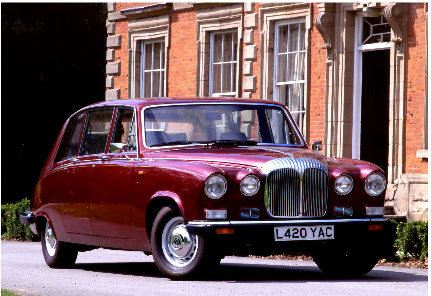
1994 Daimler Limo

Instagram www.instagram.com/jaguardaimlerheritage.trust