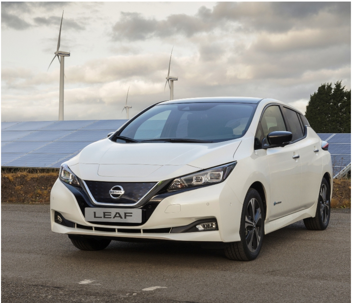
Nissan's Sunderland-built LEAF.

Online version: https://www.wheels-alive.co.uk/what-price-electric-vehicles-in-the-uk-and-abroad/