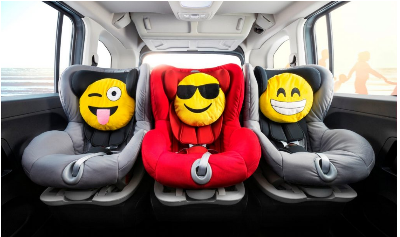
2018 Opel Combo Life