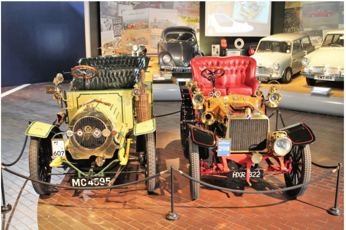
Genevieve and Spyker at Beaulieu.

Celebrating the 70th year of the iconic film Genevieve depicting the London to Brighton veteran car run. Genevieve and the other car from the iconic movie, Spyker, will be on display in the museum over the summer, and Genevieve will be in the Collections Centre for