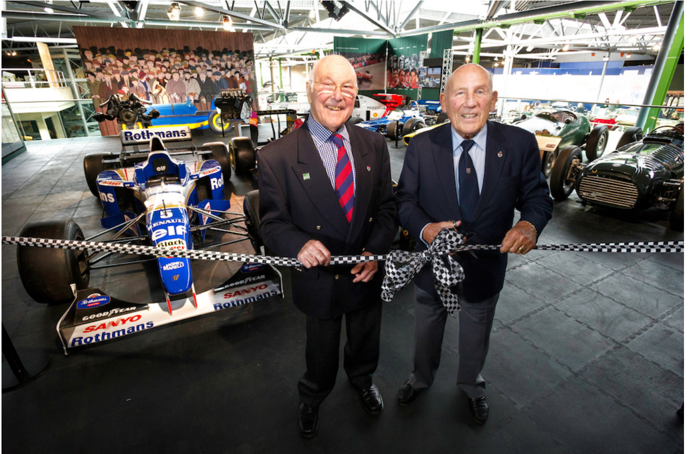
05 March 2015. Opening of two motor sport displays; Grand Prix Greats and Road, Race and Rally, collectively known as A Chequered History. VIP guests Murray Walker and Sir Stirling Moss officially open the new exhibitions.