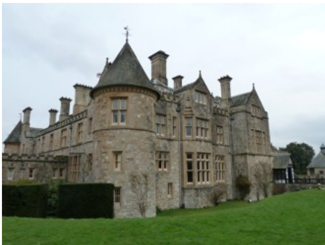
Palace House at Beaulieu. The entrance hall of this wonderful building used to house

Therefore imagine my delight when, for a recent significant birthday of mine, I discovered that my wife, daughter and son had kindly arranged a 'grand day out' for me to Beaulieu. The idea was to take a day off and, at a meandering 'touristy' speed, for once simply enjoy all the wonders that the National Motor Museum and other associated attractions have to offer.