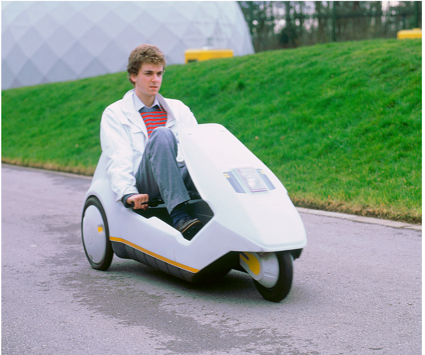
The Sinclair C5 - from the 1980s.