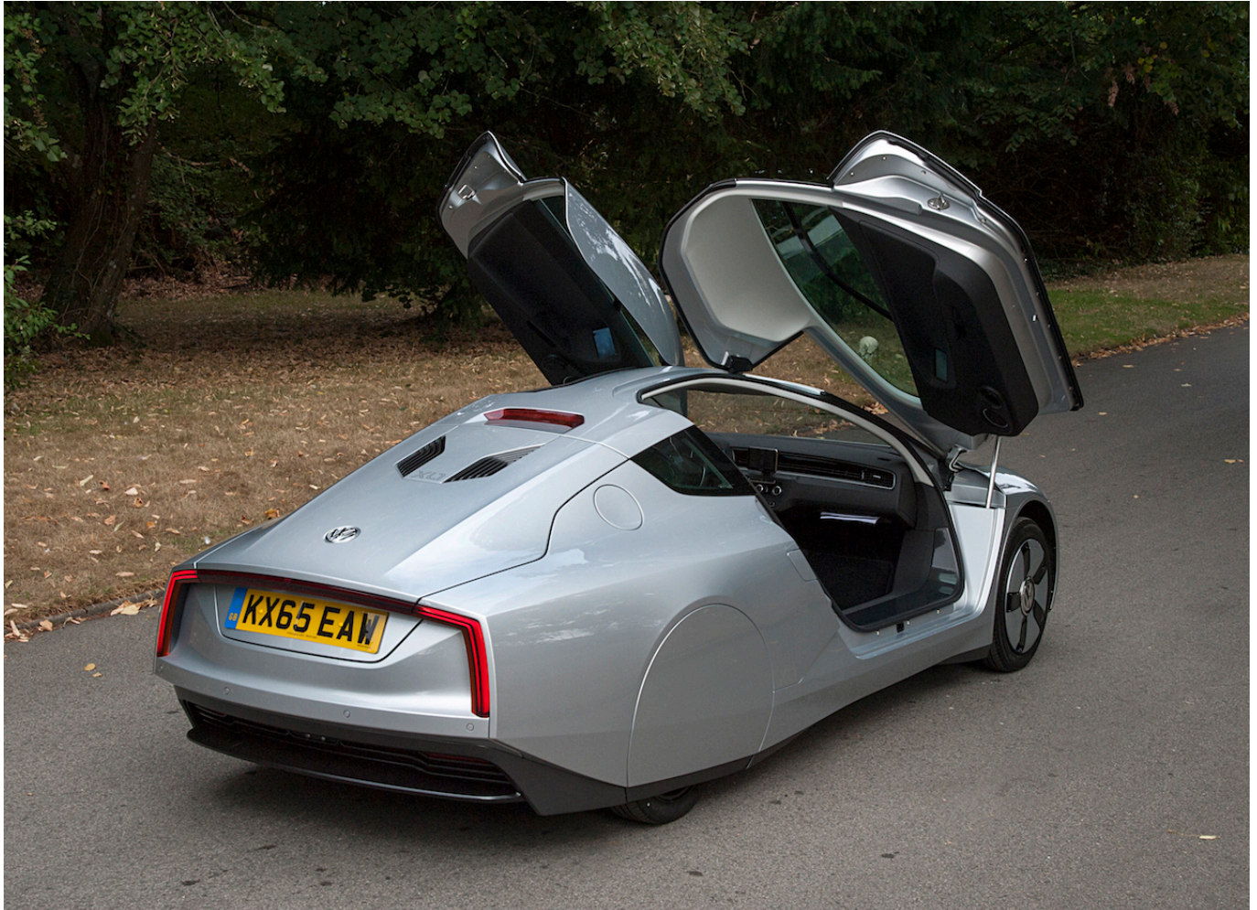
2014 Volkswagen XL1 hybrid.

Visitors to the Museum will see bold visions for vehicles and the built environment in which they would operate. The title of the exhibition is inspired by the work of British architect Geoffrey Alan Jellicoe. In the 1950s he described the place where vehicles and humans co-exist in harmony as Motopia. Much earlier, at the turn of the 20th Century, another visionary, John Scott Montagu, second Lord Montagu of Beaulieu, was predicting fast roads connecting cities. Successive generations have taken these ideas and built upon them. The exhibition looks at those and other visions of the future from the past.