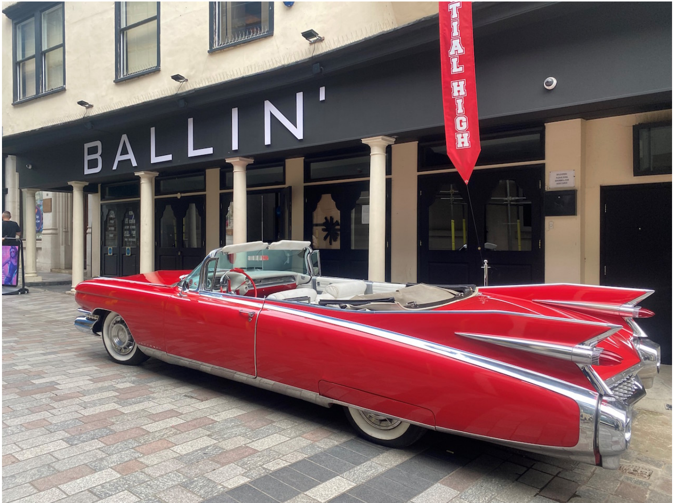
Cadillac - in the age of huge fins!