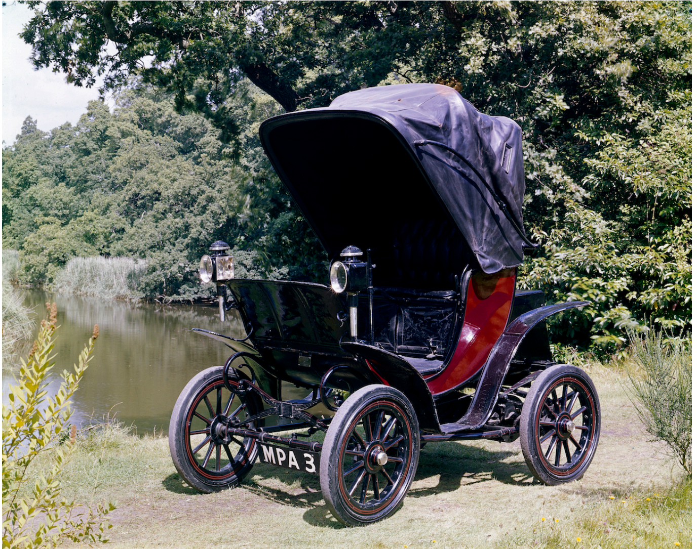
1901 Columbia electric City and Suburban.