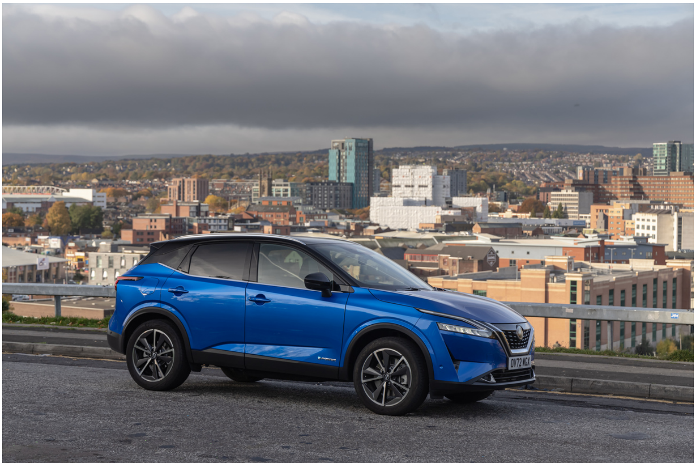
Nissan Qashqai – best-selling car in the U.K. in March 2024. Pictured is the e-POWER version.

Online version: https://www.wheels-alive.co.uk/smmt-car-sales-figures-for-march-2024-and-fuel-prices-increase/