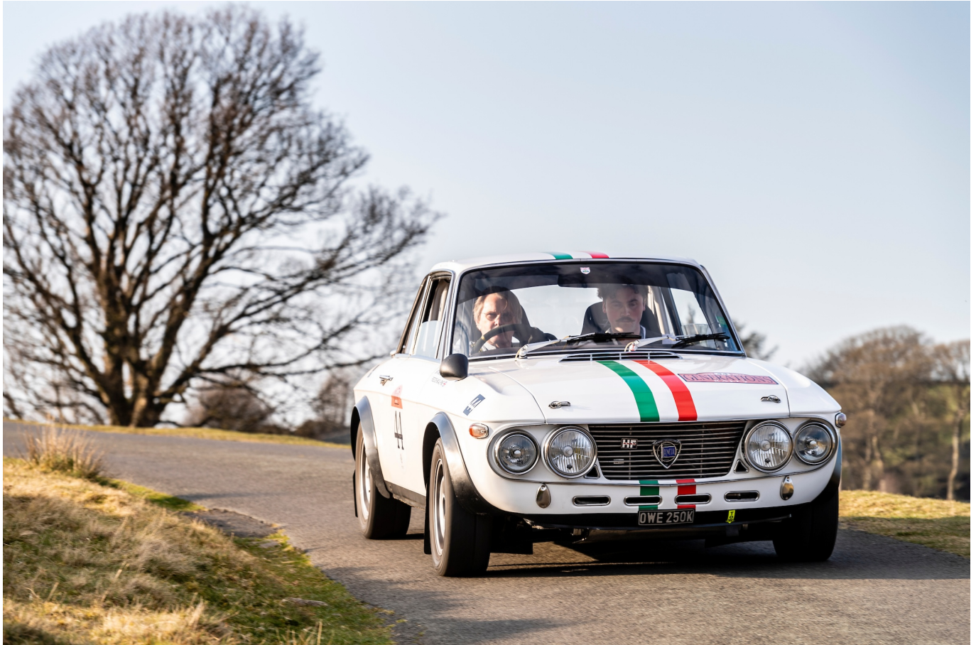
Fulvia Coupé HF.

The Fulvia was followed by the legendary Lancia Stratos - the first car designed specifically for rally competition - and then by the Rally 037 and Delta S4 during the fearsome Group B era, before the iconic Delta HF integrale cemented the company's place in motorsport history. By the time Lancia withdrew from rallying, it had amassed an unrivalled total of 10 FIA World Rally Championship Manufacturers' titles - a record that still stands today.