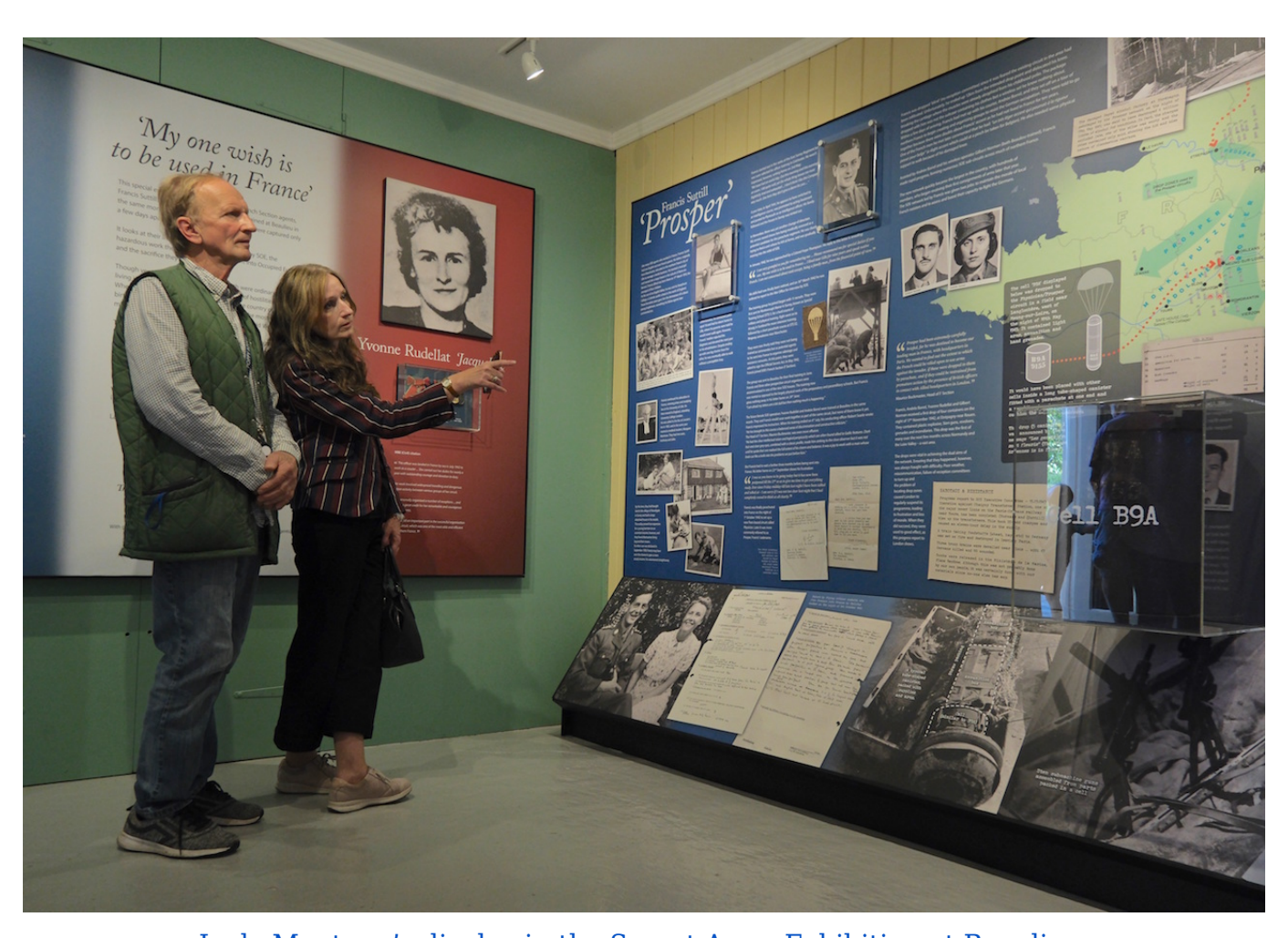
Lady Montagu's display in the Secret Army Exhibition at Beaulieu.

https://www.wheels-alive.co.uk/new-at-beaulieu-for-2024-lady-montagu-tells-the-personal-stories-of-two-agents-in-the-special-operation s-executive/