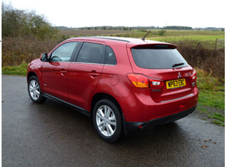
The rear three quarters view of the ASX shows the wide rear doors, which provide easy access for passengers.

Buyers can choose from three trim levels (2, 3 and 4); even the entry-level '2' version comes complete with aluminium alloy road wheels, remote control keyless entry, air conditioning, a hands-free Bluetooth system and 'Mitsubishi - Active Stability and Traction Control' (M-ASTC). All benefit from a five star Euro NCAP safety rating, with a host of safety-related features, including seven airbags. The body shell has been produced incorporating Mitsubishi's 'RISE' ('Reinforced Impact Safety Evolution') approach.