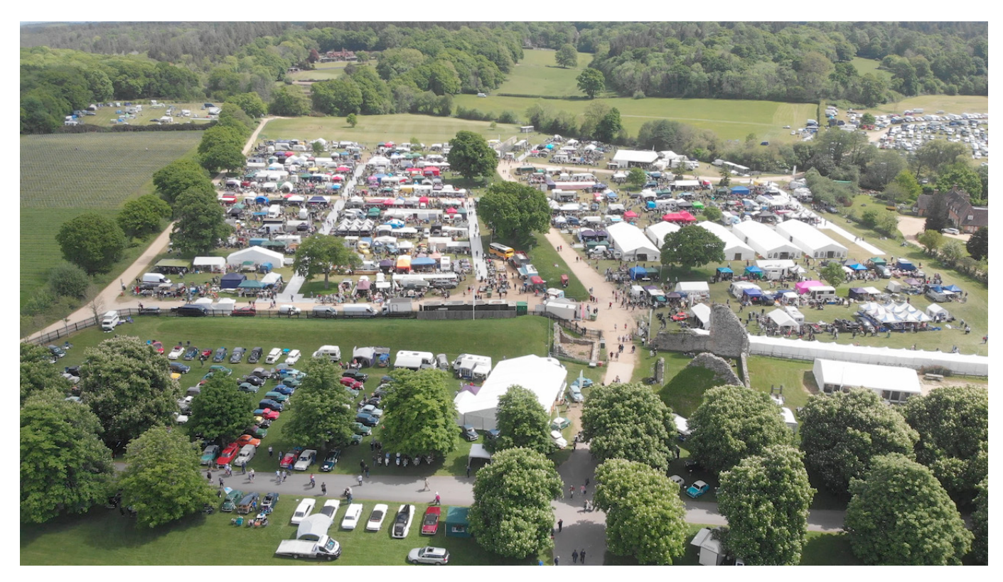
An aerial view...

Spring Autojumble will be back for 2023, as impressive car club displays join hundreds of stands laden with great automotive buys, for a busy show on 13<sup>th</sup> and 14<sup>th</sup> May in the Beaulieu grounds.