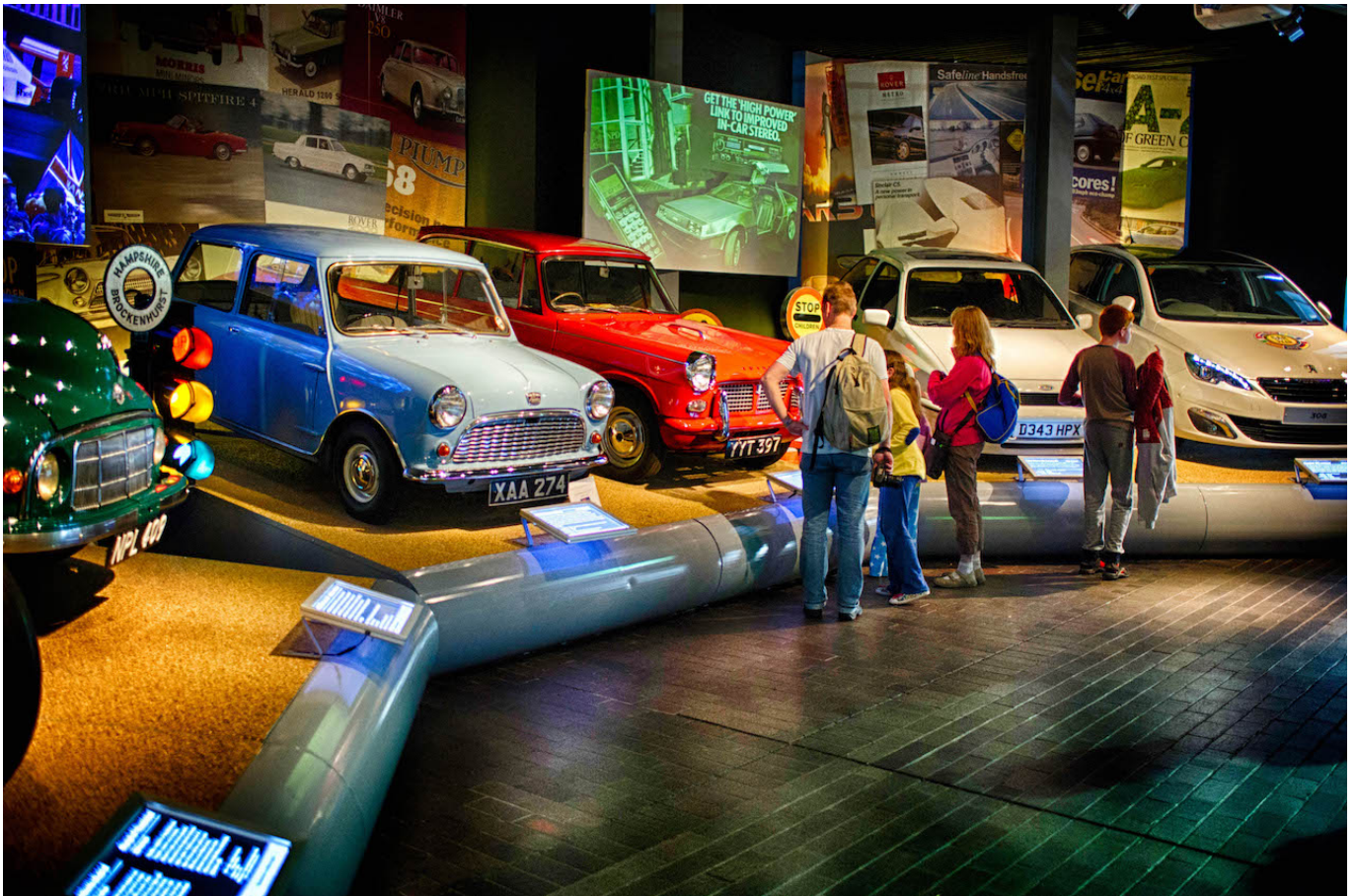
Entrance display.

contribution towards the Motoring into the Future project – to transform the museum entrance and initial exhibition areas, for a more engaging and interactive start to its visitor journey.