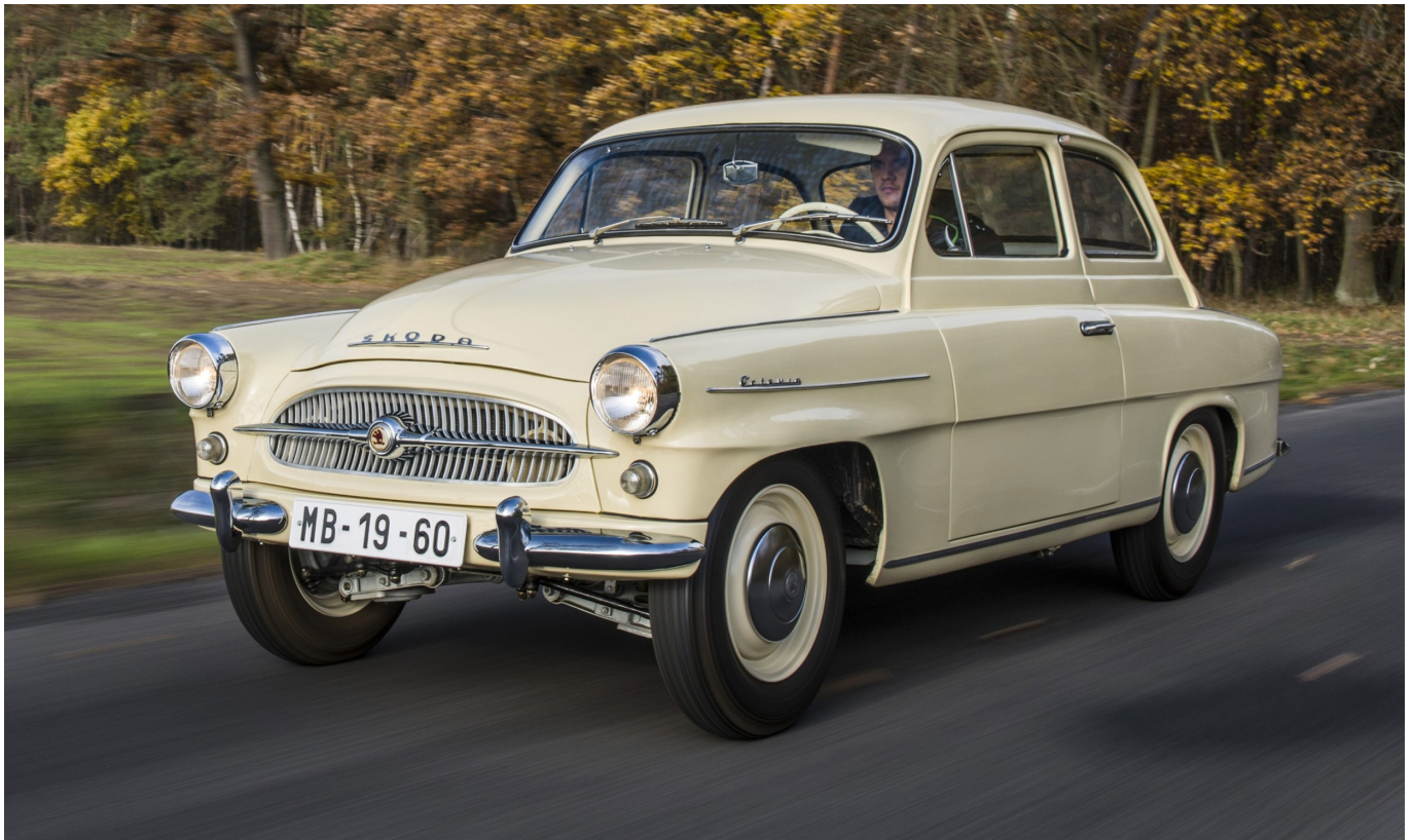
The first Octavia arrived in 1959.

was launched in its own domestic market. The name Octavia is derived from the Latin word eight as it marked the eighth post war car built by Skoda. With 61 years of history behind Octavia with over 6.5-million sales now the fourth generation models are here and ready to continue their record as Skoda's top selling range.