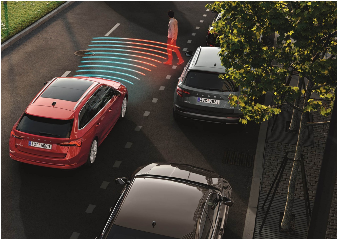
Skoda's new Octavia with the latest safety support technology included.

My test car, the Octavia SE L First Edition Hatch with the 2.0 TDI 150 hp turbodiesel engine and seven speed DSG auto gearbox has an on-the-road price of £28,460. But there were options added such as the 18-inch alloys at £680, head-up display at £690, Titan Blue metallic paint at £595 and a steel space-saver spare wheel at £180 making a total price of £30,605. Given its size, spaciousness, quality, styling inside and out and driving performance I think proves the new Octavia remains a fair bargain and in these uncertain times that makes Skoda's Simply Clever marketing theme very appropriate.