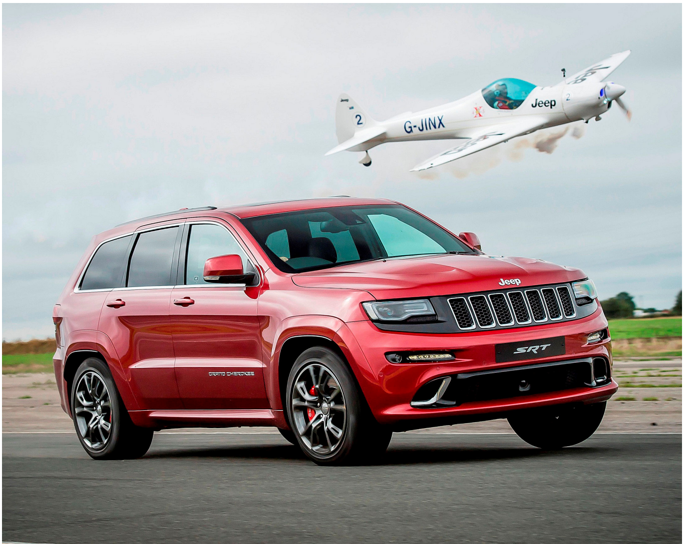
Jeep Cherokee SRT vs Silence Twister aircraft. Blyton Park circuit.

Online version: https://www.wheels-alive.co.uk/latest-jeep-grand-cherokee-road-test/