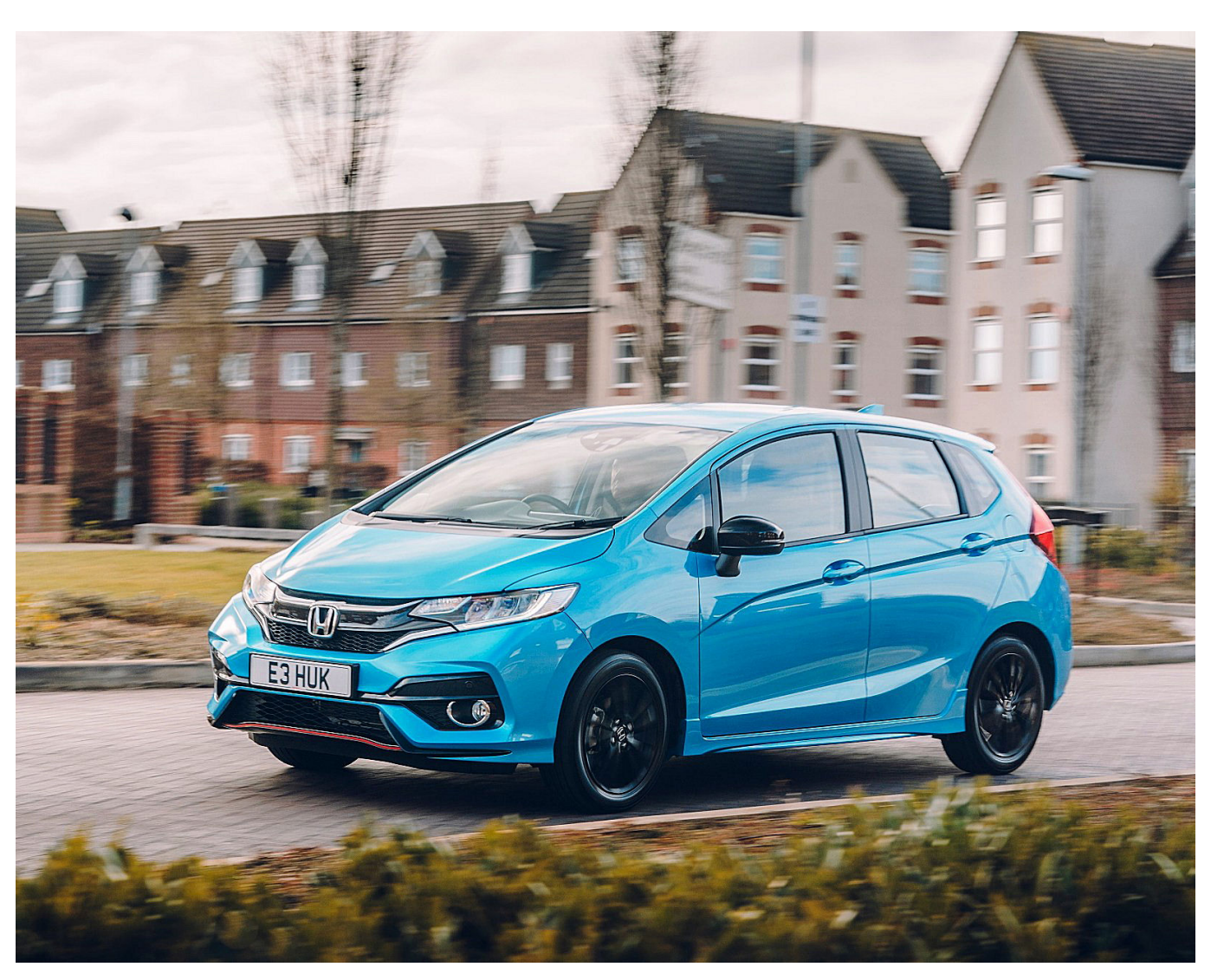
The 2018 Honda Jazz 1.5 i-VTEC Sport Navi

On line\ version: \ {\tt https://www.wheels-alive.co.uk/latest-honda-jazz-road-test/}