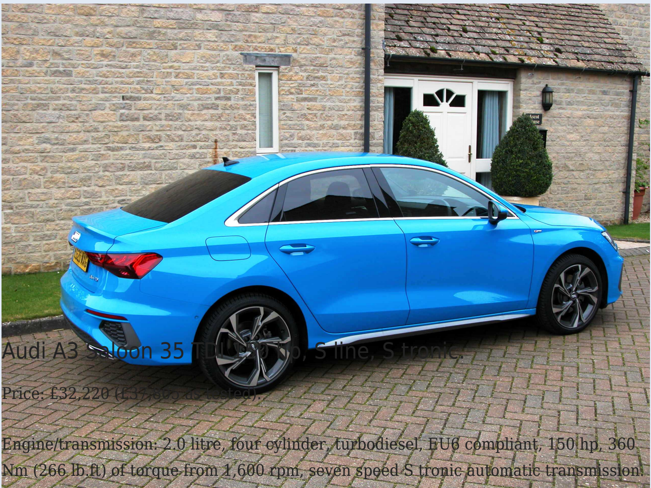
Audi A3 saloon 35 TDI 150 hp, S line, S tronic.