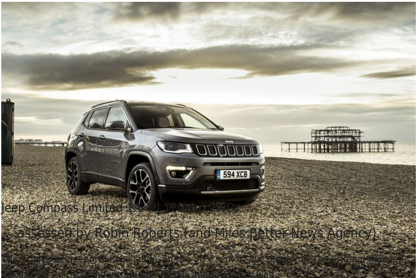
Jeep Compass Limited 1.6 MJ 120hp 2WD

assessed by Robin Roberts (and Miles Better News Agency)