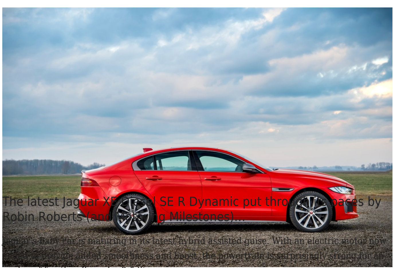
engine of fractionally under 2.0 litres.

The Jaguar XE series was introduced in 2015 to replace the X-Type and has been refreshed over six years so it now comprises more than a dozen models using the same four-door saloon body with petrol or diesel engines in rear or all-wheel-drive form, and with five trim levels from standard to highly sporting as befits Jaguar's heritage.