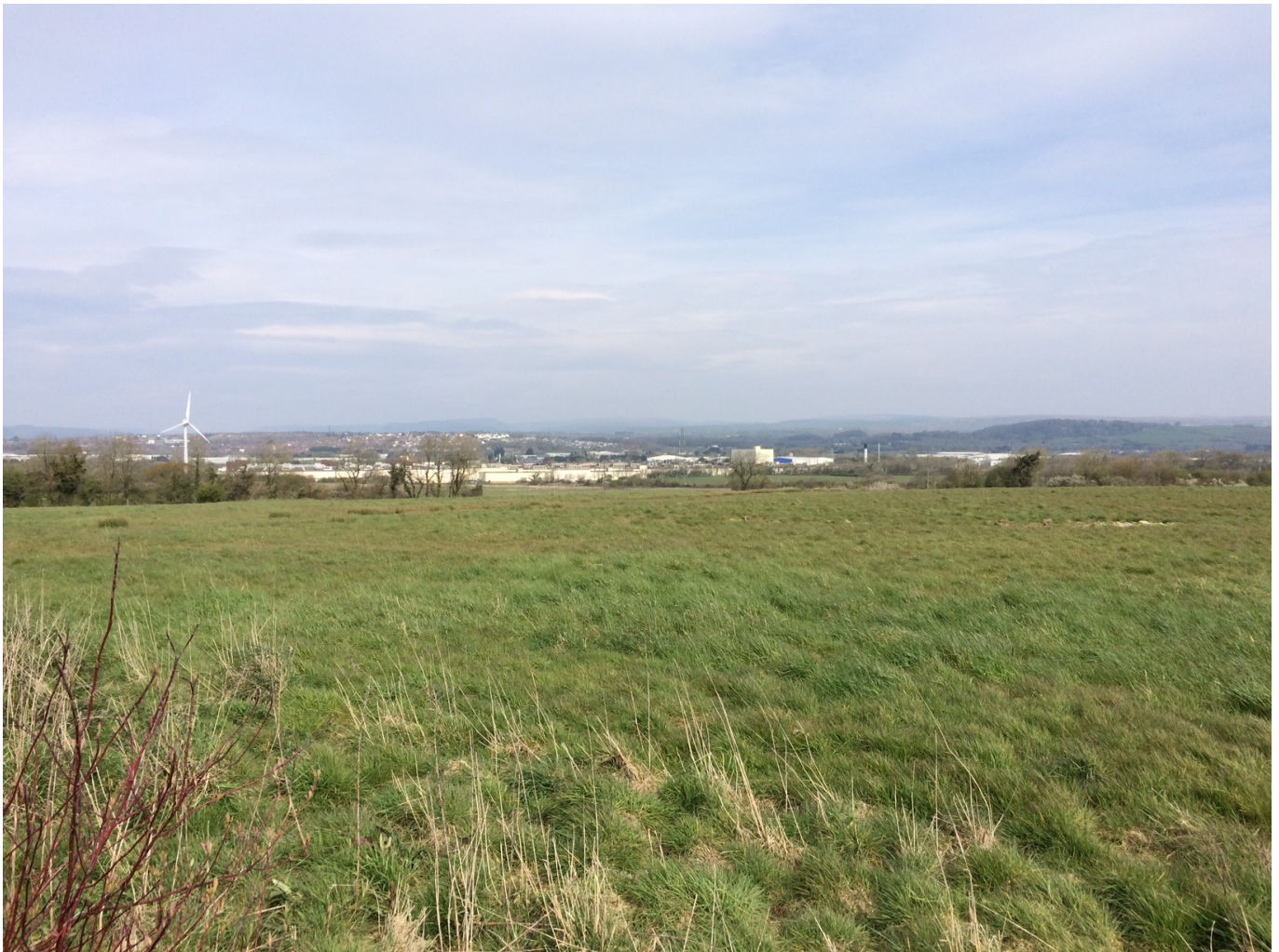
The Brocastle site to be home to Ineos production, with the Ford Bridgend plate in the distance...

The first phase at Brocastle due to be completed covers 250,000 sq ft but there is a further 500,000 sq ft of space for future expansion and INEOS Automotive is in talks with two Wales-based component supply companies to support their work which could provide a further boost to the Welsh economy.