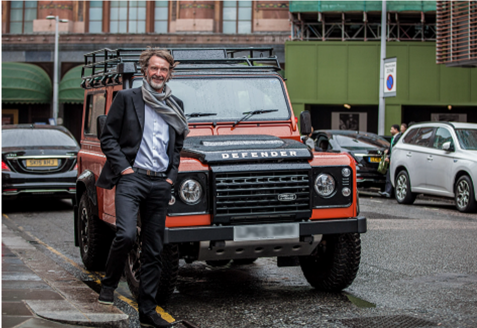
Sir Jim Radcliffe, founder of Ineos, with a Land Rover Defender which his Grenadier model will replace.

The go-ahead today follows months of speculation that the so-called Projekt Grenadier's backer and one of the UK's richest men, Sir Jim Radcliffe, wanted to build his serious 4x4 model in Britain under his Ineos Automotive brand.