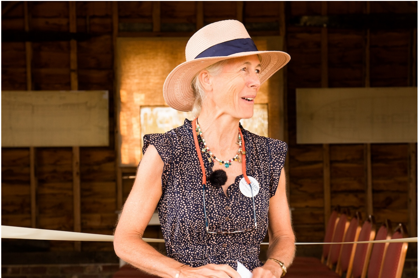
The Hon. Mary Montagu-Scott opening the HMS Agamemnon - Navigating the Legend' exhibition in 2022.