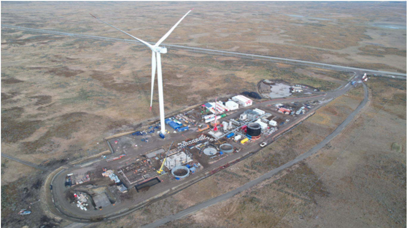
Aerial view of Haru Oni site under construction.

https://www.wheels-alive.co.uk/hif-highly-innovative-fuels-global-and-its-partners-start-production-of-carbon-neutral-efuel-in-chile/