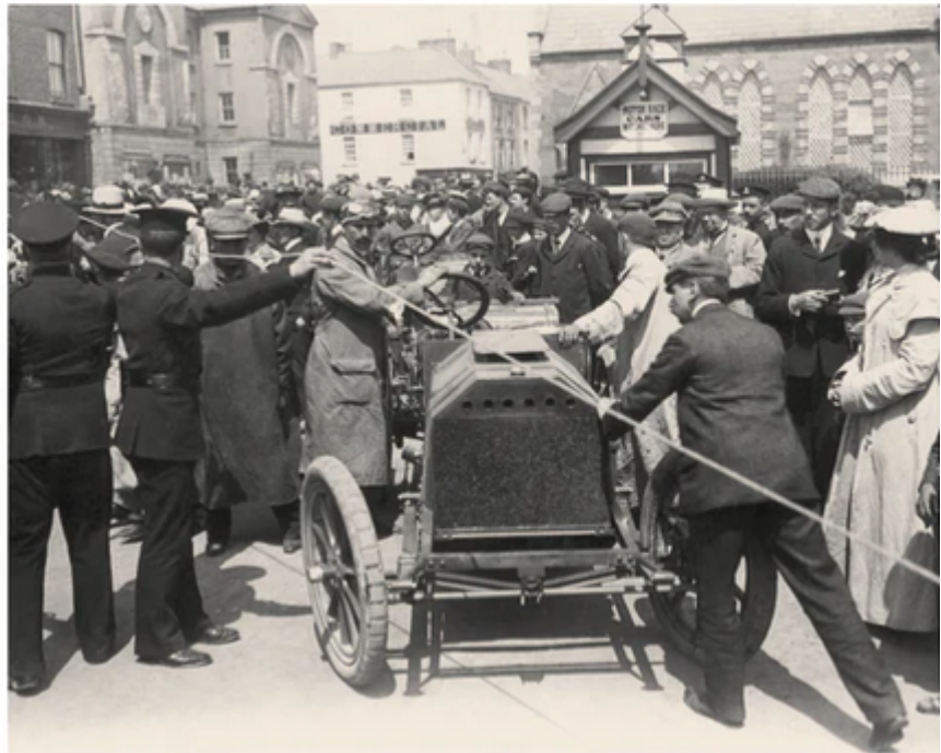
The 'Contents' page of the book.