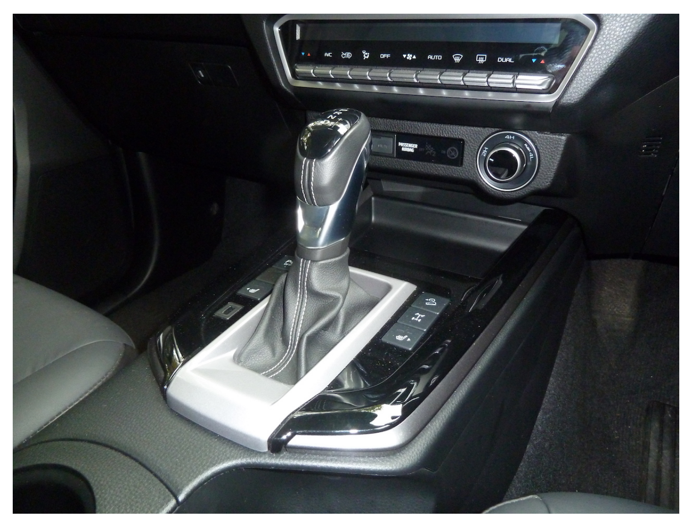
Auto transmission lever, rotary control for drive mode selection, and heating/ventilation 'buttons' all logically positioned and within easy reach of the driver.

Four wheel drive D-Max models incorporate three drive modes, engaged by means of a rotary control, located beneath the central touchscreen and within easy reach of the driver. I did not venture off-road with the test vehicle (this is a road test feature rather than an off-road article), but this control operates quickly, easily and logically.