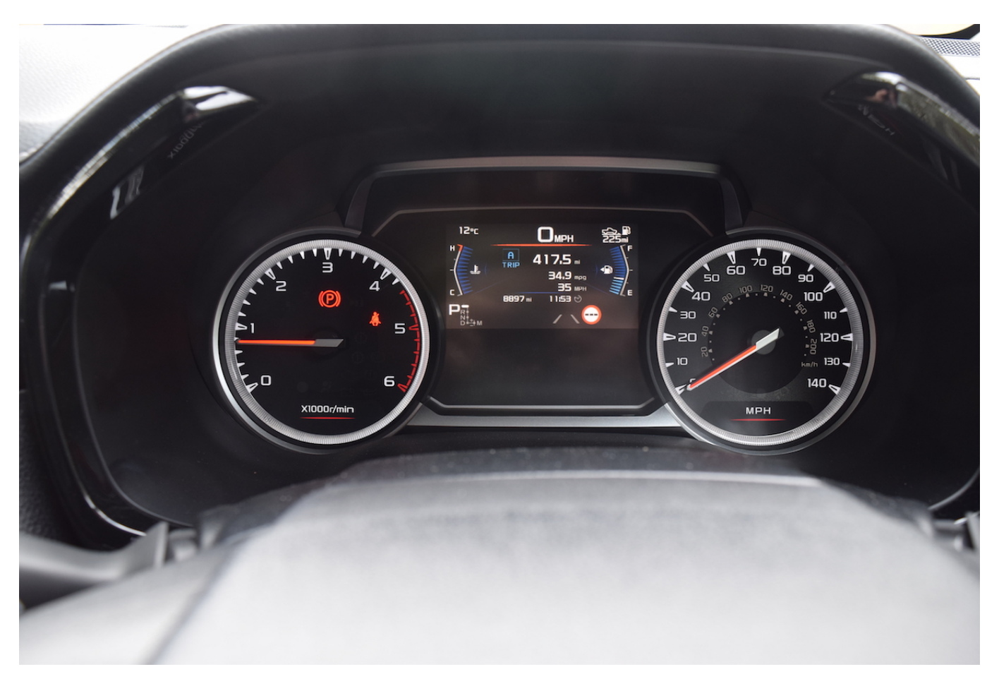
Clear instrumentation... and the vehicle's trip computer showed an average consumption of 34.9 miles per gallon over 418 miles.