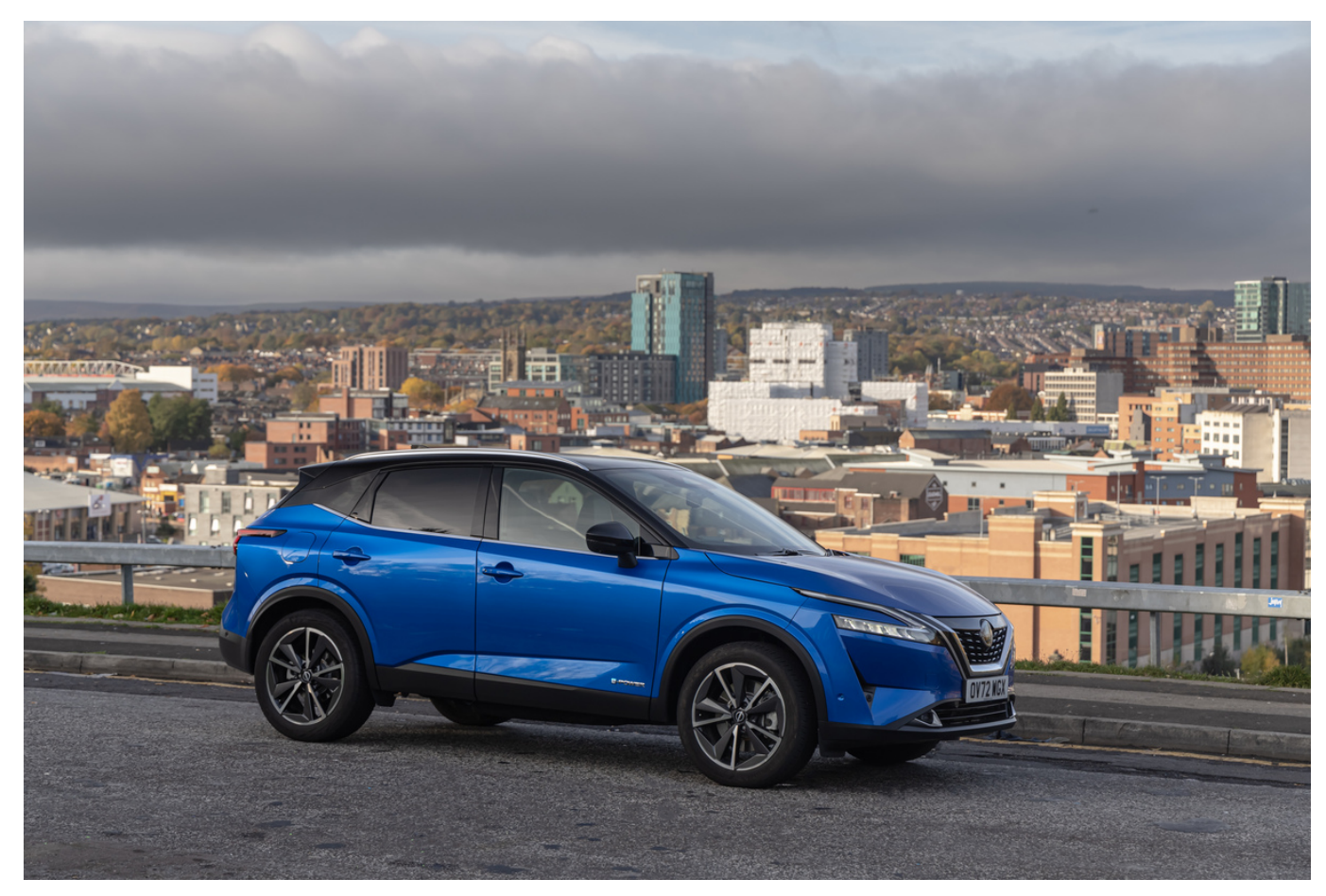
Nissan Qashqai – best-selling car in the U.K. in March 2024. Pictured is the e-POWER version.

Online version: https://www.wheels-alive.co.uk/smmt-car-sales-figures-for-march-2024-and-fuel-prices-increase/