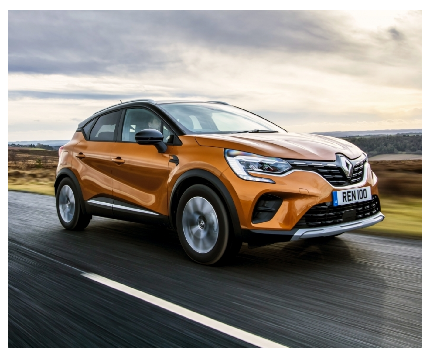
Renault Captur, one of many models from many brands offering pay later PCP deals.

It's a buyer's market – shop around. These are just a few of the many financial offers available so hopefully there will be enough buyers around to take them up.