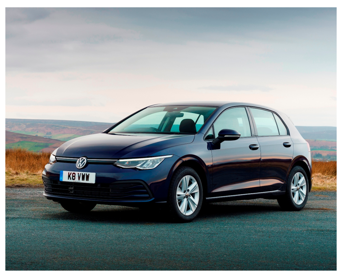
VW's new Golf Life entry level model launched.

The eighth-generation Golf opened for orders in February 2020 with two 1.5 litre petrol engines and two 2.0 litre diesel units on offer, while a month later the advanced 1.5 eTSI mild-hybrid was made available. With the arrival of this frugal new powertrain option, the entry-price of the Golf is now £23,300 on-the-road.