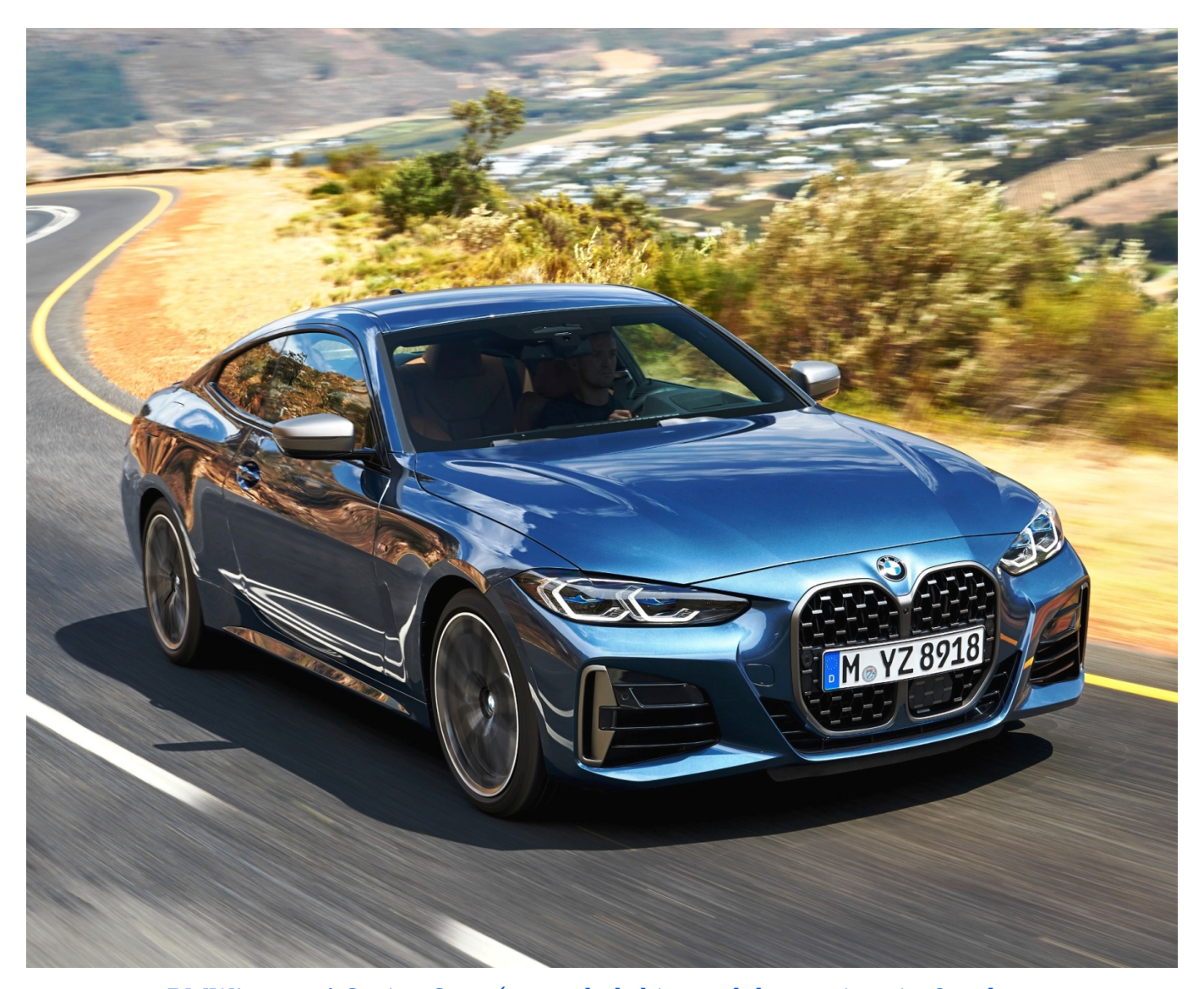
BMW's new 4 Series Coupé revealed this week but arrives in October.

The new BMW 4 Series, two door, four seater Coupé has a distinctive sharp design to set it further apart from the new 3 Series range although its use many of its components. However what have they done to the iconic BMW twin kidney grille design? The new design is huge and now looks like buttocks rather than kidneys.