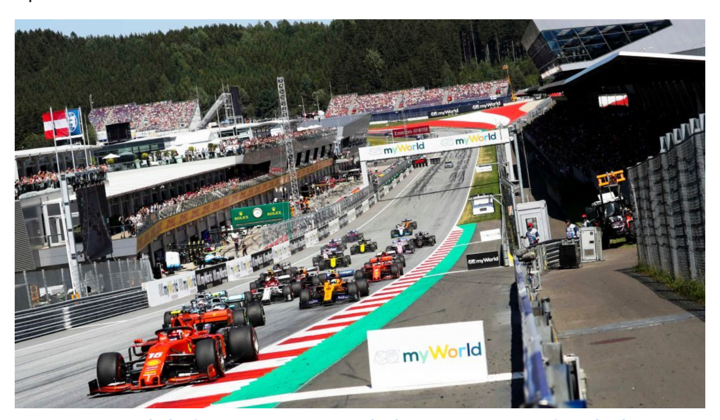
F1 returns with the first races in Austria and Silverstone's races confirmed subject to quarantine situations at the time and with no spectators.

Despite the Government's chaotic mixed messages quarantine plans it appears that at last they have approved the F1 British Grand Prix will go ahead. The oldest World Championship race will go ahead with two races – the first British Grand Prix on 2 August and the second, the 70<sup>th</sup> Anniversary Grand Prix a week later on the 9 August. No spectators will be allowed.