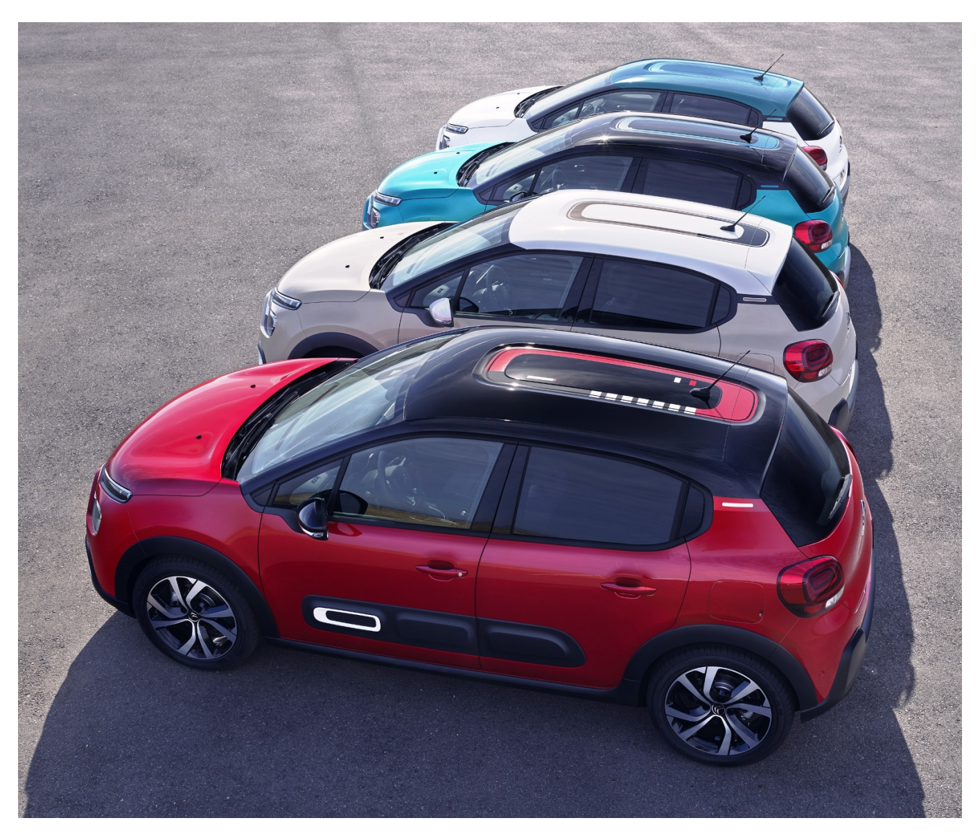
Citroën's refreshed C3 model range with 97 different exterior customisable options.

Citroën's revised C3 supermini hatchback range is the latest evolution of the French brand's worldwide best-seller. The third generation Citroën C3 has already secured more than 780,000 sales globally since its launch in 2016. The revised C3 features the brand's latest front-end styling, updated interiors and efficient RDE2-compliant petrol and diesel engines. Order books for UK customers opened this week with deliveries expected in August.