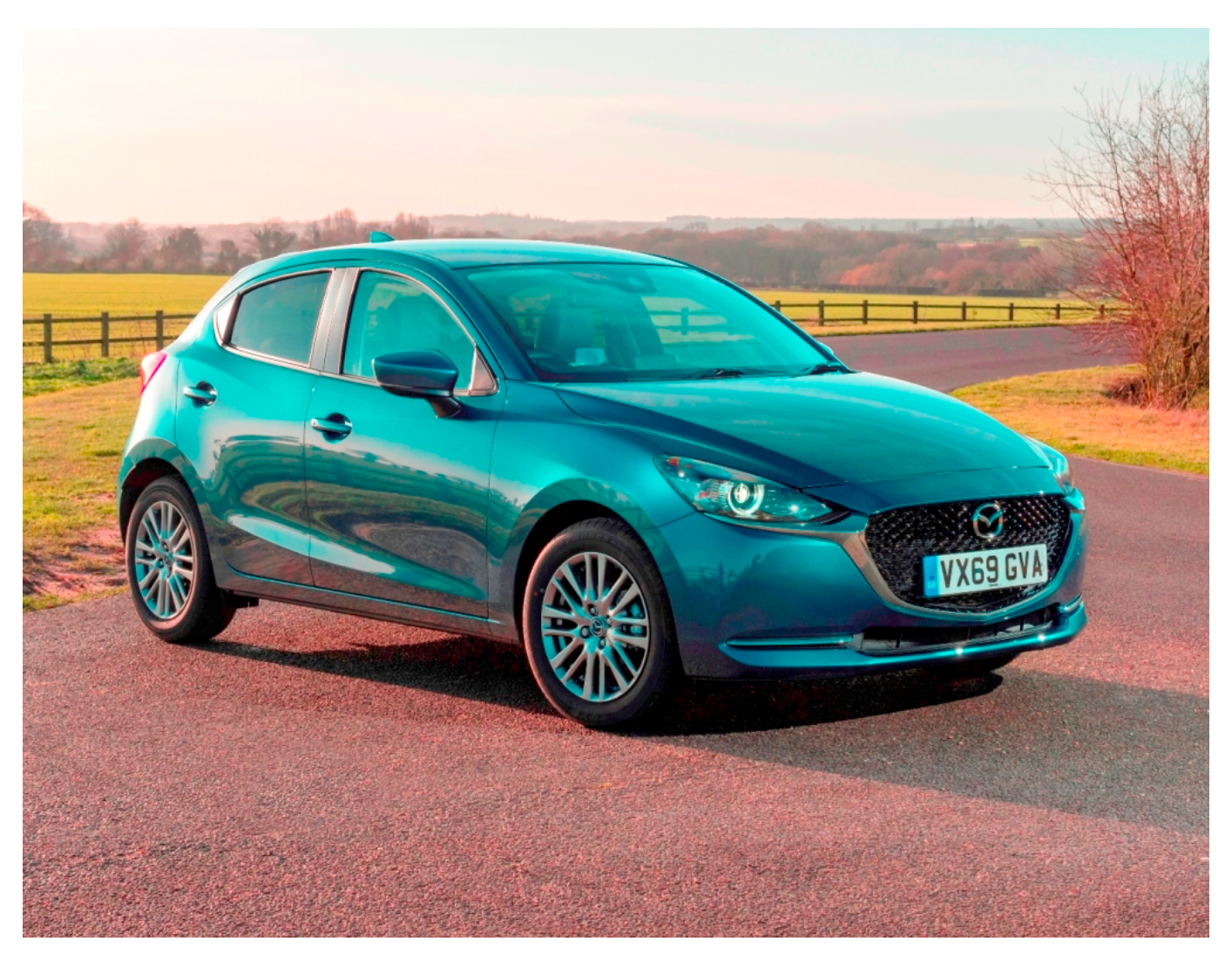
Mazda2 available through their 'an offer for our time' scheme.

Mazda have introduced what they call 'An Offer For Our Time' with 0% PCP finance across their full six car range with no minimum deposit required, low monthly payments for up to 48 months and a £500 deposit contribution for their Mazda2. Their Mazda3 is available with 0% PCP, no minimum deposit and a 48 month repayment period. Similar offers are available for other models.