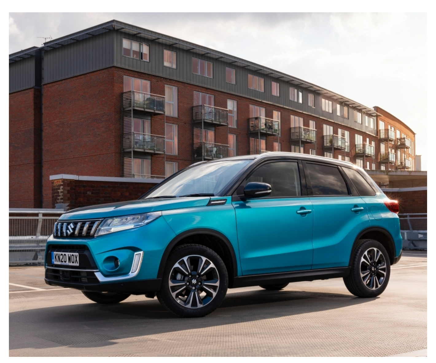
Suzuki's new Vitara Hybrid 48v available under the brand's new Buy&Try scheme.

All models marry a 1.4-litre Boosterjet petrol engine with a new 48-volt hybrid electric Integrated Starter Generator and a lithium-ion battery pack. The system's generator also acts as a starter motor and assists the petrol engine during vehicle acceleration with higher levels of 235 Nm (173 lb.ft) torque from 2,000 rpm.