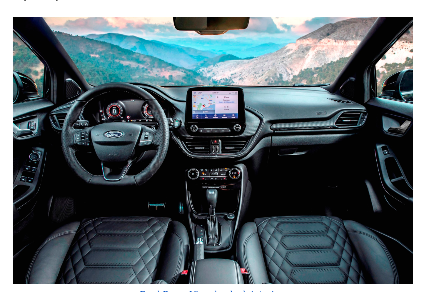
Ford Puma Vignale plush interior.

Ford's recently launched Puma SUV styled compact crossover range gains a Vignale flagship version priced from £25,240. The added premium spec includes 18-inch alloys, a satin aluminium upper grille and surround, ebony lower grille, and body-coloured lower rear bumper. Standard specification also includes signature LED headlights, Windsor leather seats, wrapped instrument cluster, heated front seats, heated steering wheel and Ford KeyFree system.