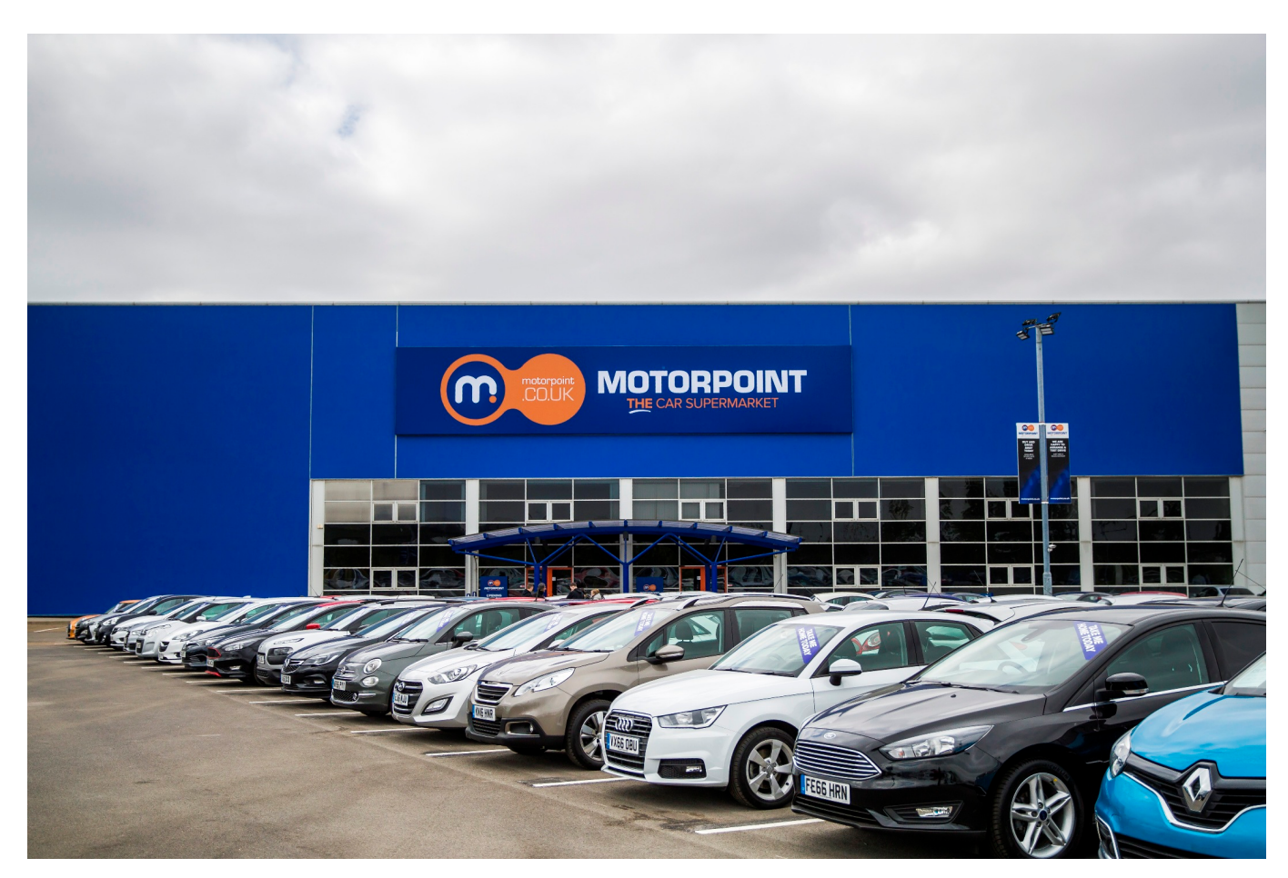
Motorpoint has completed their 1,000th home delivery to customers since the lockdown started.

Motorpoint the UK's largest independent car retailer has just completed its 1,000^{th} home delivery since lockdown started. Their free home delivery service comes with a 14-day money back guarantee.