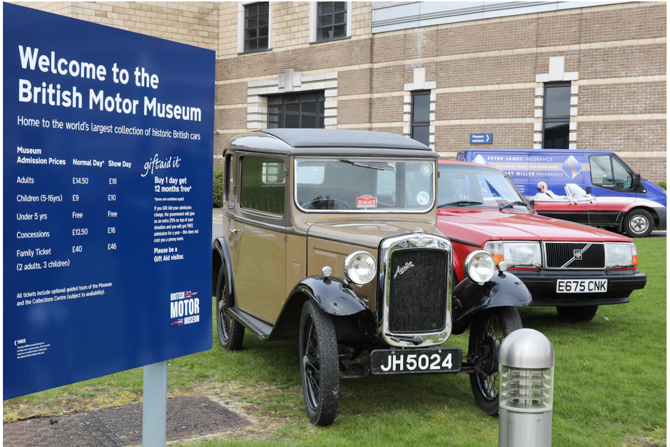
Austin Seven on 'hand-over day' at the British Motor Museum, Gaydon.