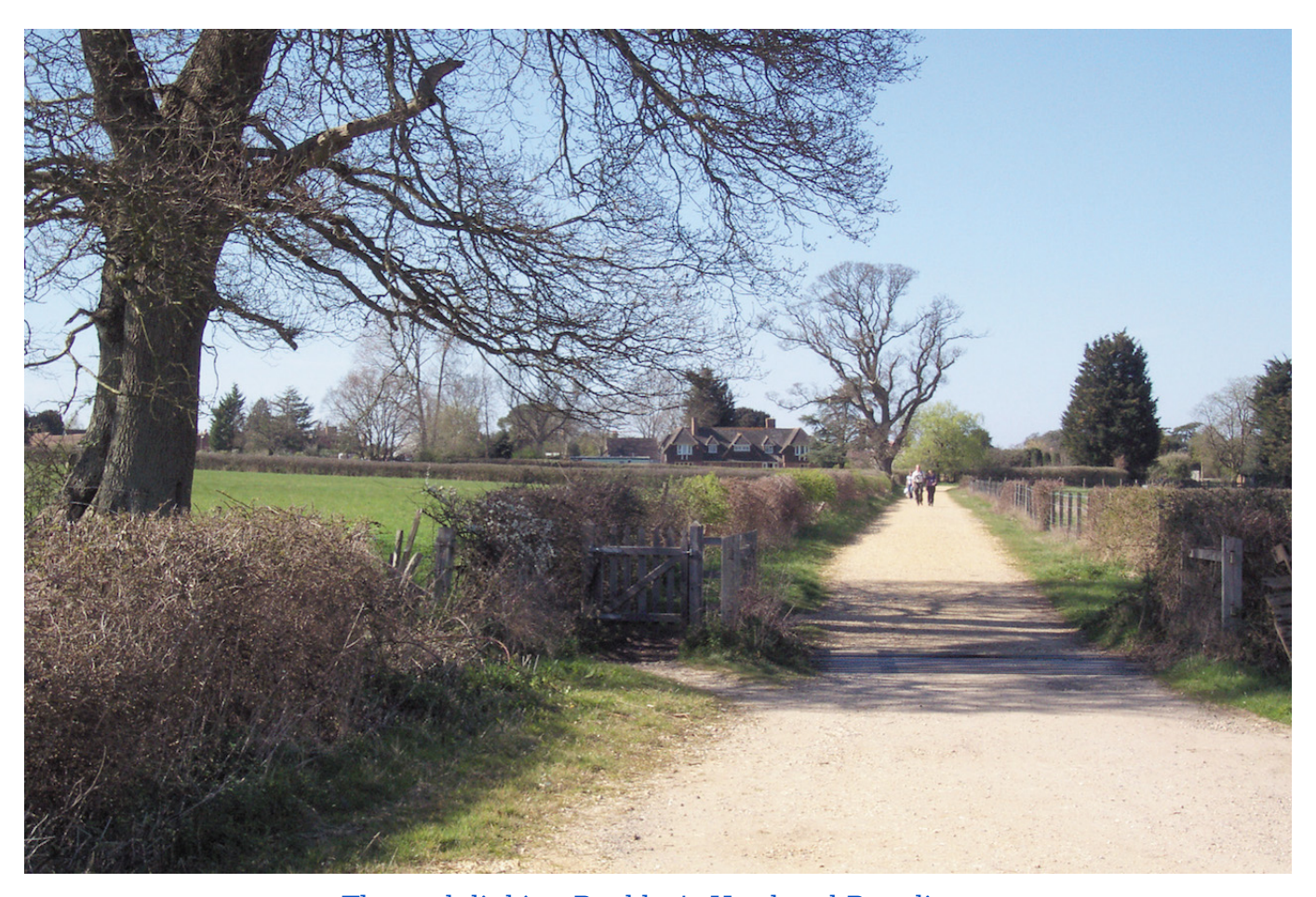
The path linking Buckler's Hard and Beaulieu.