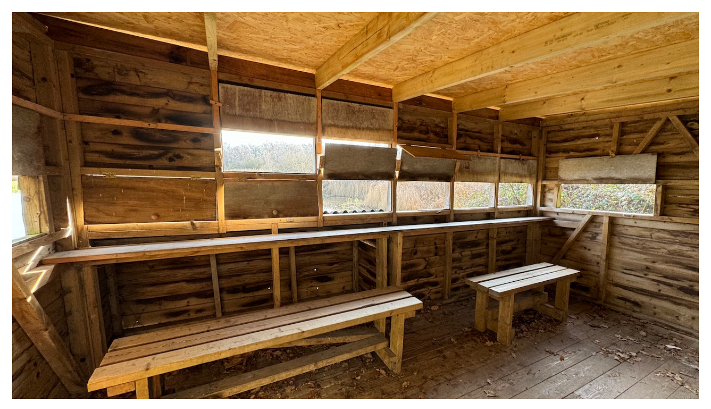
The bird hide.

The Beaulieu Estate's coastline provides habitats for 50% of the Solent's breeding pairs of ringed plover, as well as 40% of Hampshire's breeding population of oystercatchers. The Beaulieu River and surrounding area form part of a Special Area of Conservation (SAC) as well as a Site of Special Scientific Interest (SSSI), providing habitats for more than 200 species of birdlife.