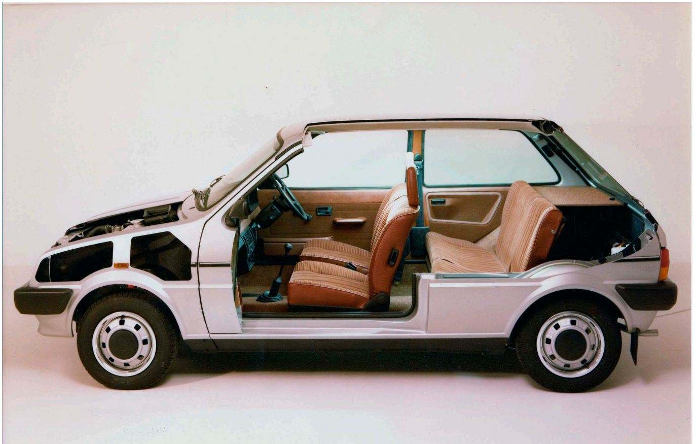
Austin Mini Metro 1.3 HLS 1980. A sectioned car demonstrating packaging and interior space. It was silver with paprika trim.

of Britain's best-selling small cars. The exhibition, which went live on 9 September, is free to view from the Museum's website and gives everyone the chance to celebrate this iconic car's special birthday.