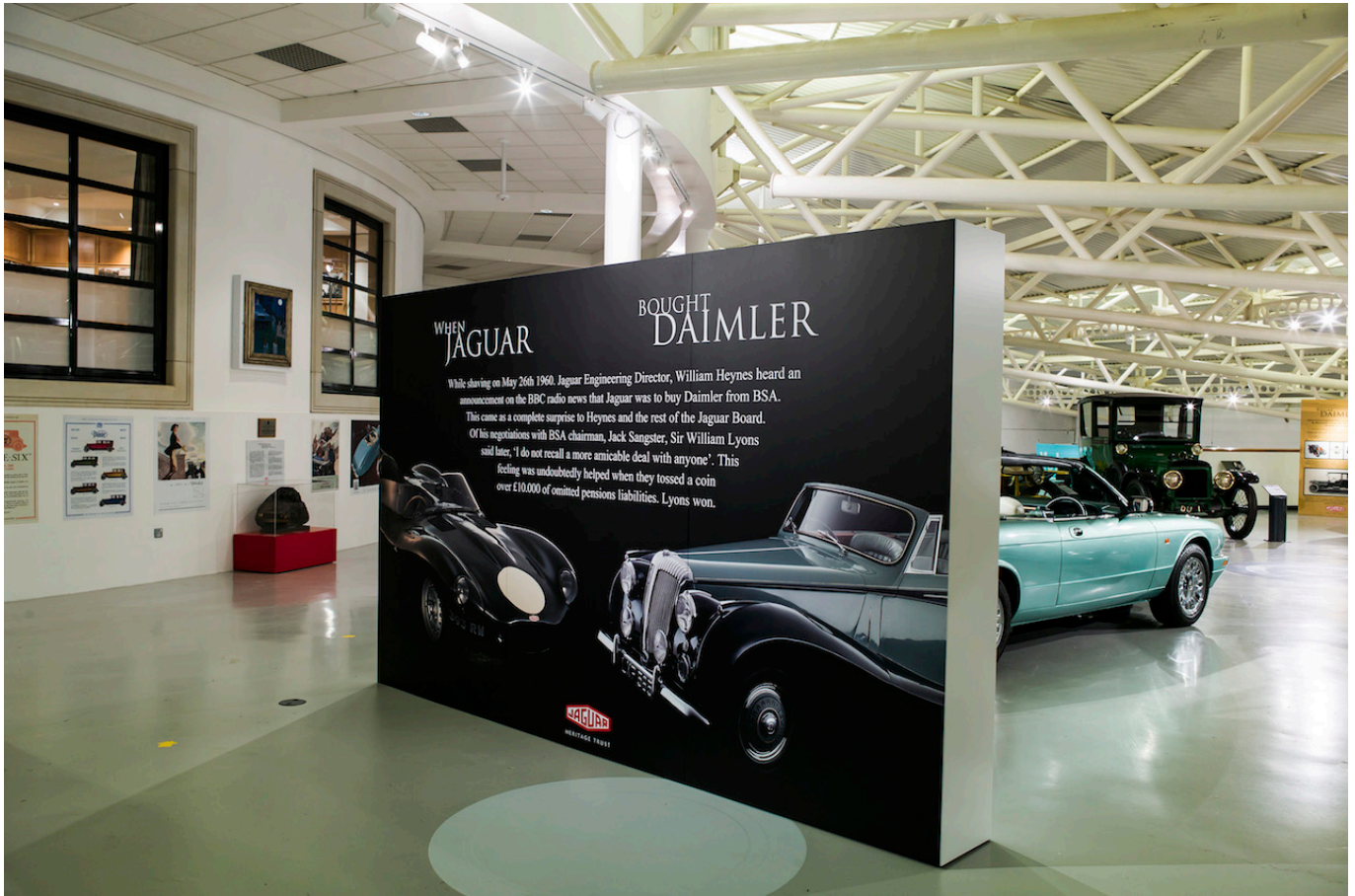
When Jaguar bought Daimler Intro board.

The Museum has also remained very active online throughout this unprecedented year with its #historybeginsathome social posts and a lively blog. On 13 October the Museum also held its first 'Gaydon Gathering', an informal socially-distanced evening for enthusiasts and their classics, with the opportunity to see the Museum's collection in action.