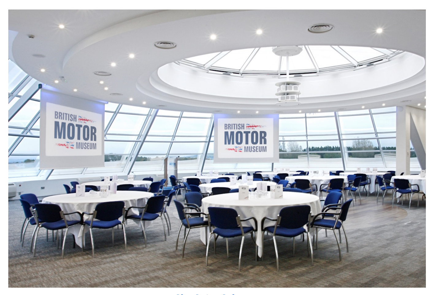
Sky Suite Cabaret.

Toby Batchelor, Head of Commerce commented, "These rooms are a great new addition and have been developed in response to client demand for large event spaces complemented with multiple large breakout spaces. The fresh modern décor, 4K data projectors and free Wi-Fi also make the rooms ideal for all sorts of meetings and events. These rooms will allow us to continue to grow our conference business and further support the Museum, as all conferencing profits are invested into the charitable Trust."