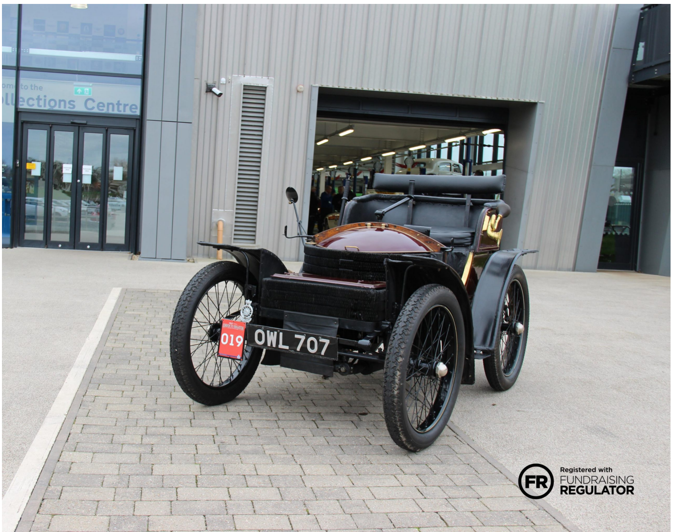
1899 Wolseley 3.5hp.

Online version: https://www.wheels-alive.co.uk/british-motor-museum-campaigns-to-fix-owls-wings/