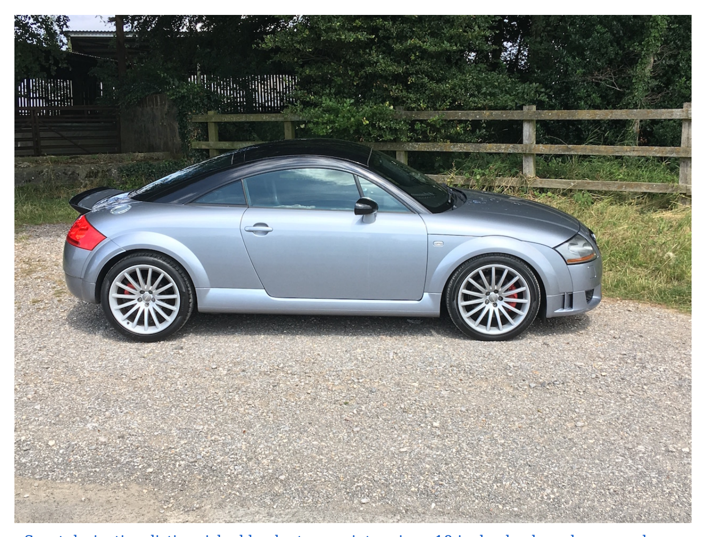
Sport derivative distinguished by duotone paint, unique 18-inch wheels and aero package.