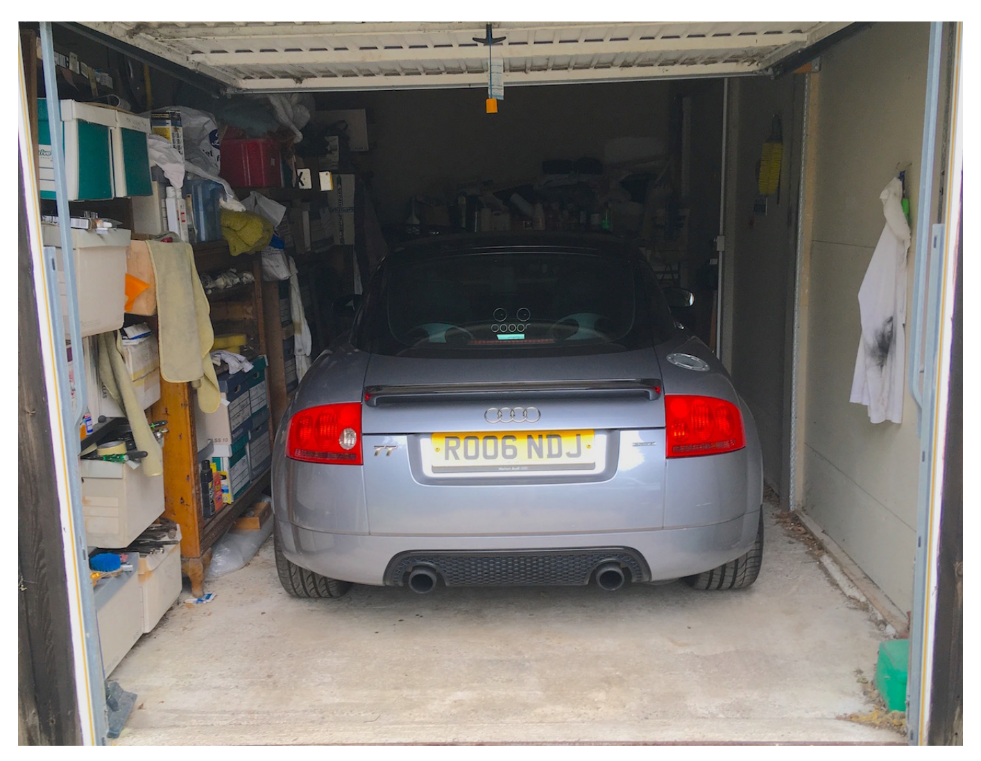
It does fit my garage, but getting out of race seats without scratching driver's door is tricky!

still admire the appearance. So, I hope it'll prove a keeper!