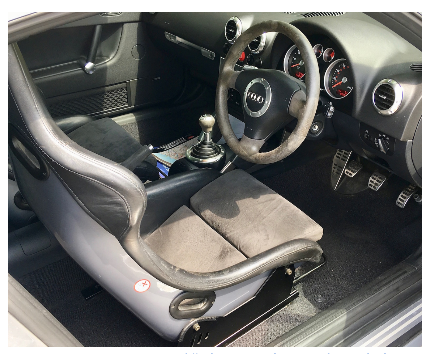
Seats are prime attraction in motion, difficult to exit in tight spaces. Alcantara leathers to steering wheel, handbrake and gear lever.