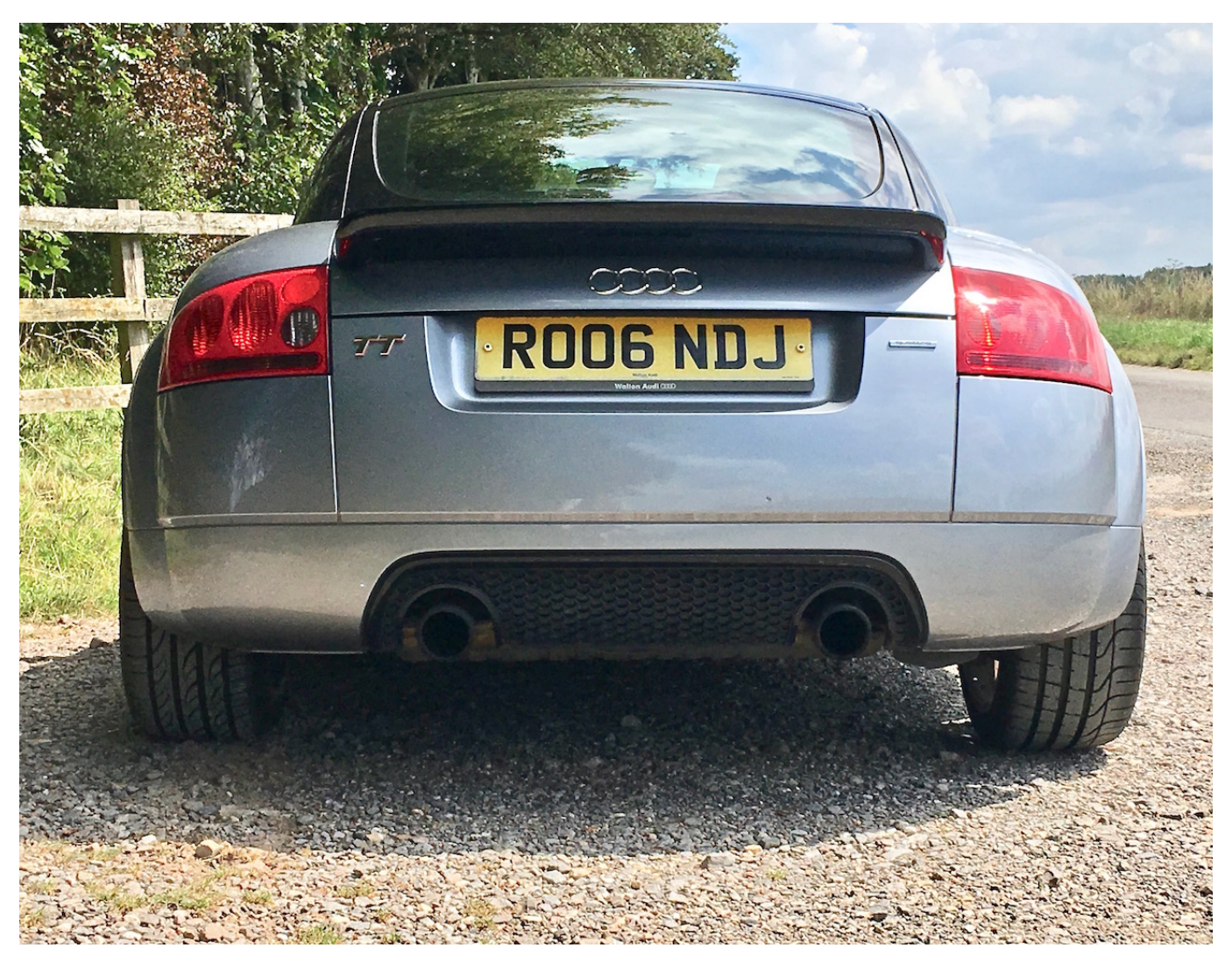
Rear little different to 225 hp TT, save extended spoiler lip and black tip exhausts, plus slightly wider rear wheels.

I fancied something enjoyable that I could improve, which retained value and delivered a splash of speed. The 1.8 litre TT sport's 0-60 mph in 5.7 seconds and a 155 mph max are not too shabby and directly compare with today's TT TFSi. The only numbers loss in the older TT is 32 mpg on a run, whereas the current TFSi reports 40 mpg.