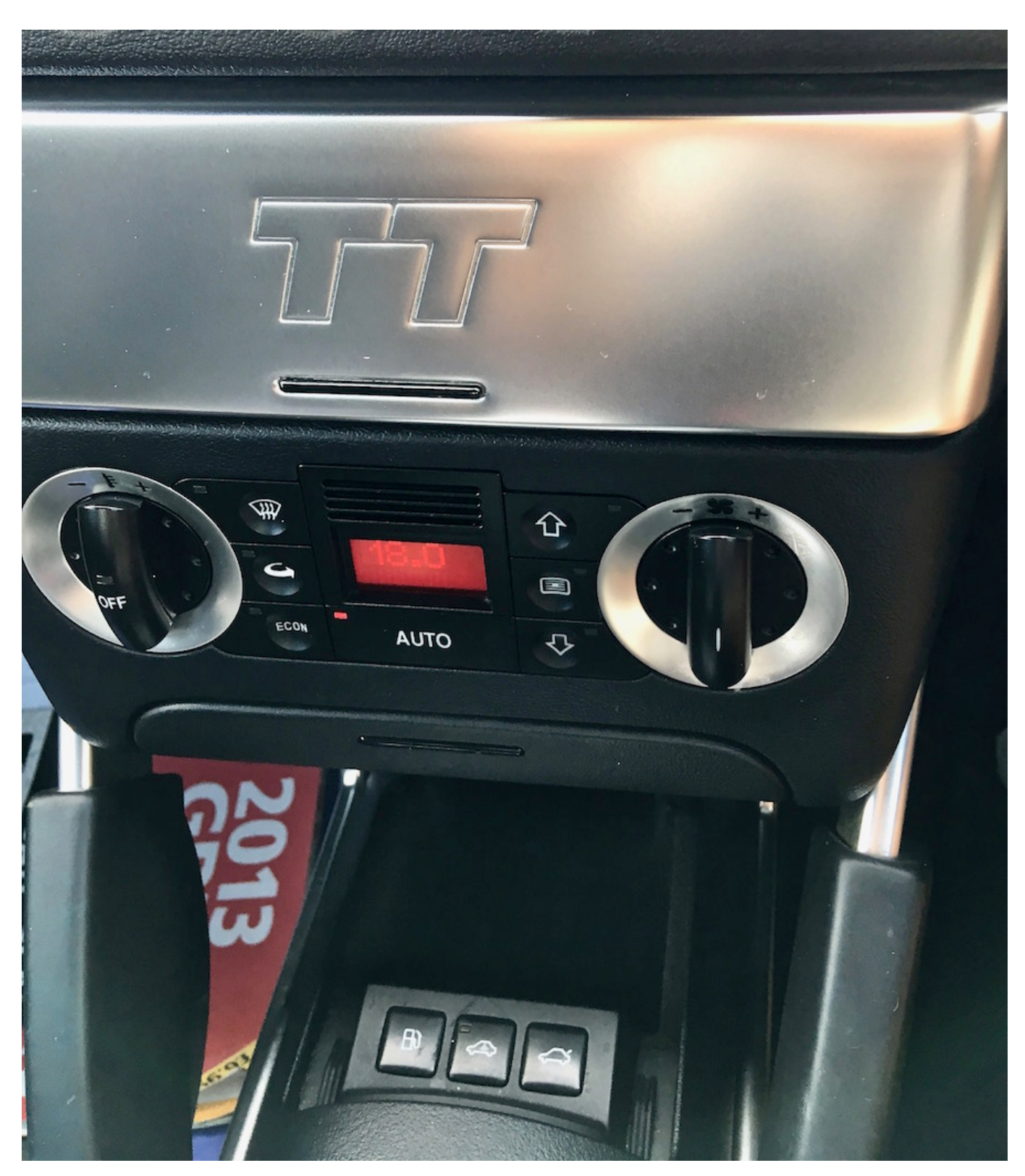
Bose Concert radio concealed beneath TT silver flap, fuel and rear boot releases under