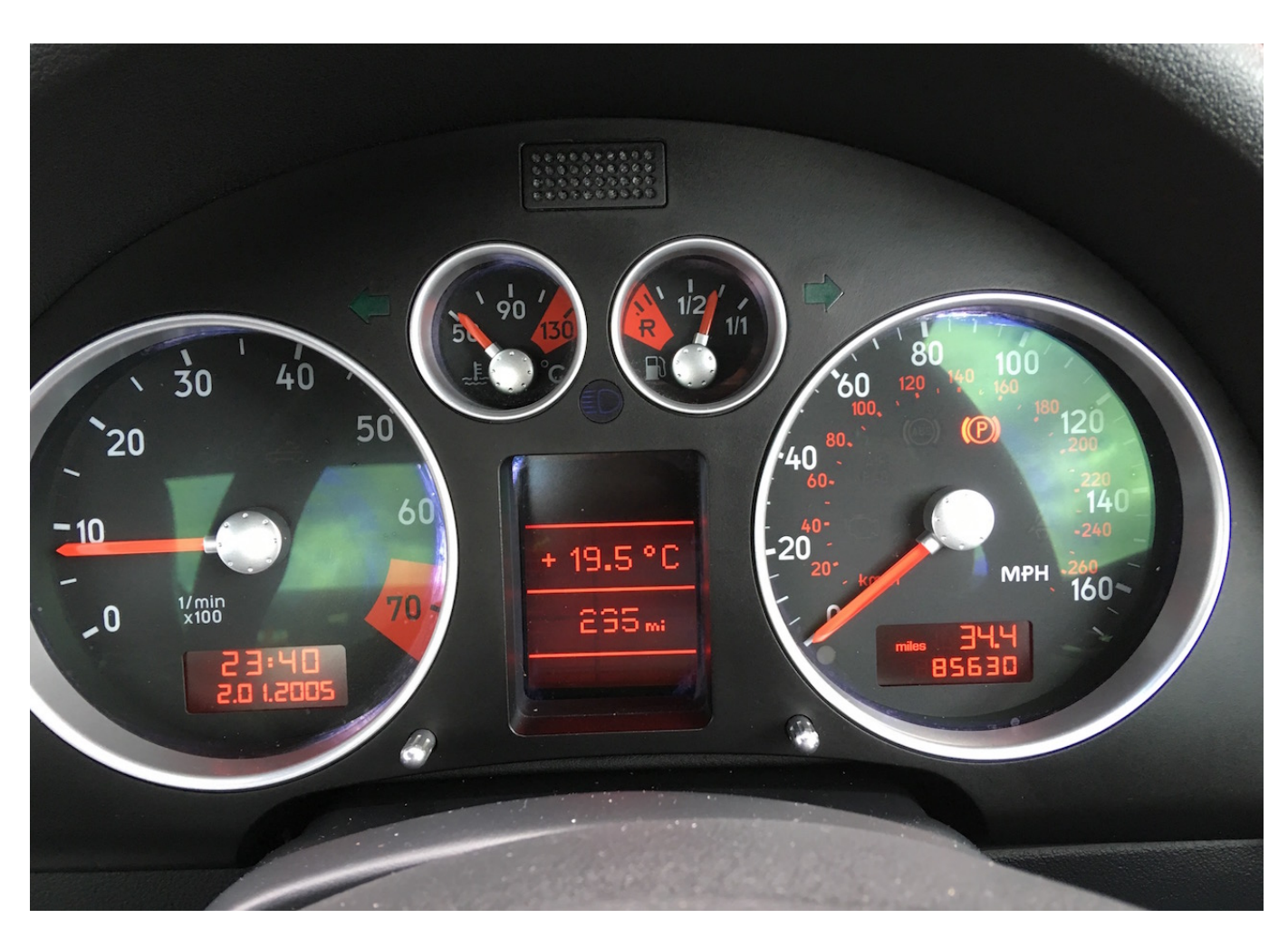
Dials soon after pick up, losing pixels in the centre readout...

Sorting out some scruffy cockpit detailing, air con and brakes were minor snags compared with my previous vehicles. I have covered only 800 TT miles, but I am a lot happier than expected from such a lack of paperwork. So far, the bills have been predictable: The air conditioning needed fixing properly with a replacement compressor and I spotted that one brake calliper was not the original red finish; that had misaligned and damaged brake pads. Including the dealer's warranty contribution to the air conditioning renovation and a minor bill for new rear pads it has yet to exceed £400 in bills, which is fine for such a gamble.