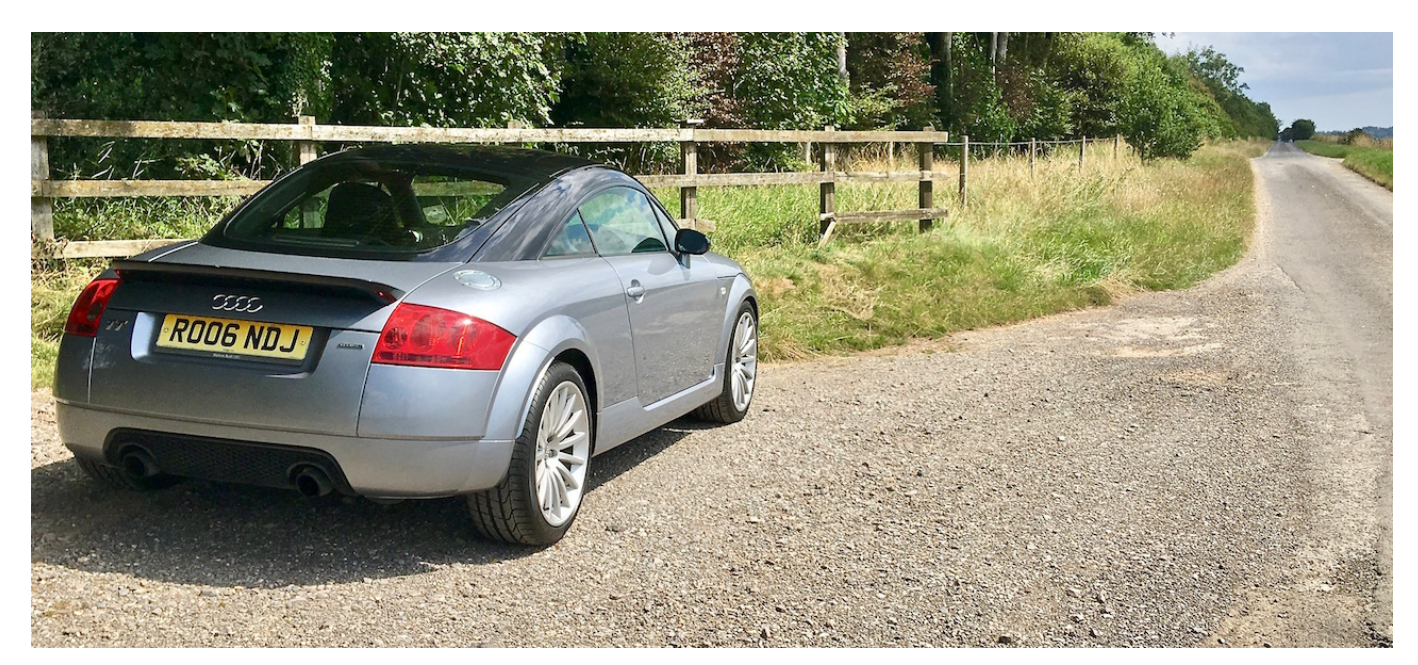
Hopefully, a long road ahead for JW and a special Audi TT.