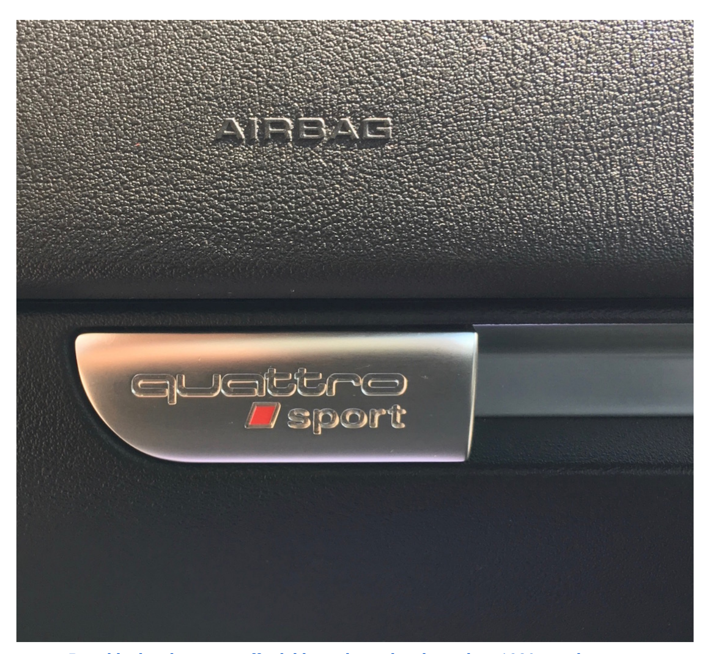
Proud badge, but more affordable package than legendary 1980s predecessor.

Underneath transplanted 3.2 TT's body kit, the battery was moved into the hatchback boot and there were tauter suspension springs and firmer dampers with a low ride height. Plus a set of 15-spoke 18-inch cast aluminium wheels, a half inch wider than standard at the rear and carrying small 'eyebrow' wheel arch extensions for legality, plus a matt black finish for the twin tailpipes.