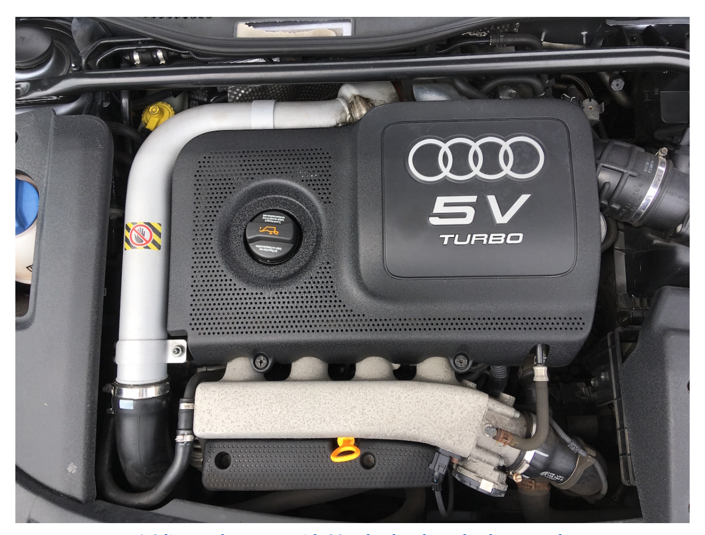
1.8 litre turbo motor with 20-valve head, modestly uprated.

Like my Elise Sport 135, the quattro sport featured a noble attempt to reduce weight [officially minus 75 kg/165 lbs.] and a mild [plus 15 PS] horsepower boost. This from a 20-valve cylinder head over 4 turbocharged cylinders.