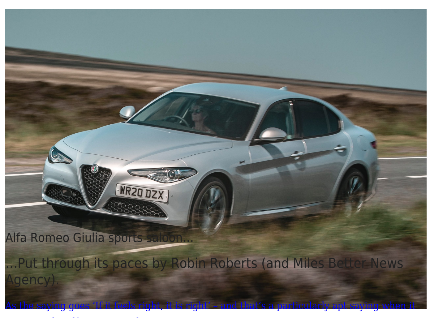
comes to the Alfa Romeo Giulia.

What's more, the sporting saloon looks striking outside and inside and when it gets moving this driver's smile widens still further.