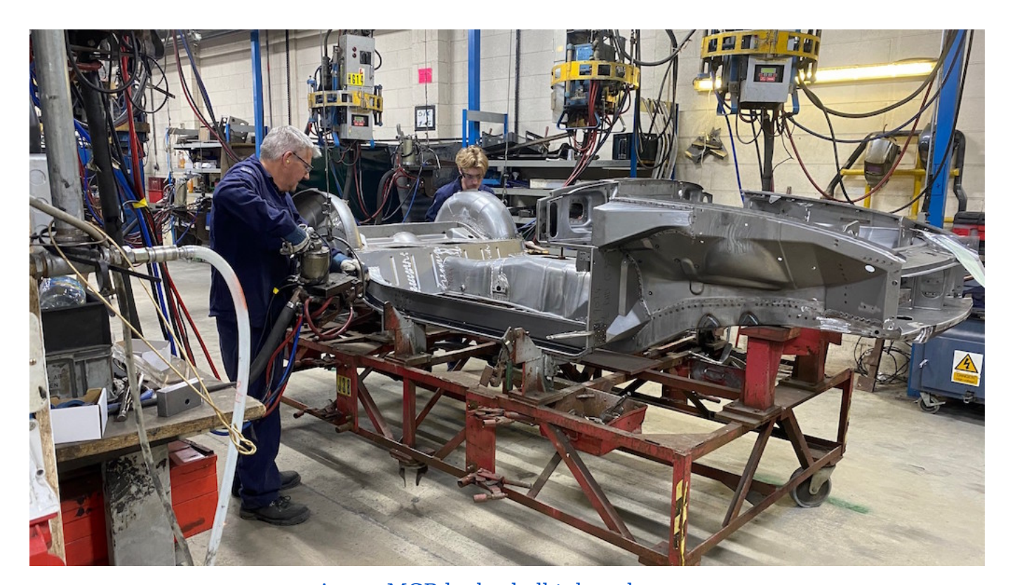
A new MGB body shell takes shape...

Adding the requirements for such 'new' classics as the Mini Remastered, RBW Electric MGB and Frontline MGB to the ongoing stream of Mini and MGB bodyshells sought by those restoring original vehicles made 2022 a record year of manufacture for British Motor Heritage (BMH). The key totals are – classic Mini, all marks, 45; MGB roadster and GT, all marks, 32.