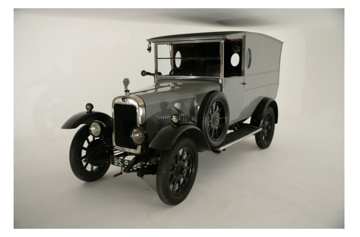
A rare Clyno 10.8hp van, dating from 1926, is another beautiful classic at Studio434.

Within the collection there are many fine examples of exotic sports cars from manufacturers such as Ferrari, Jensen, Porsche and AC, plus fine luxurious motor cars including Hispano-Suiza, Jaguar, Bentley and Rolls-Royce models.