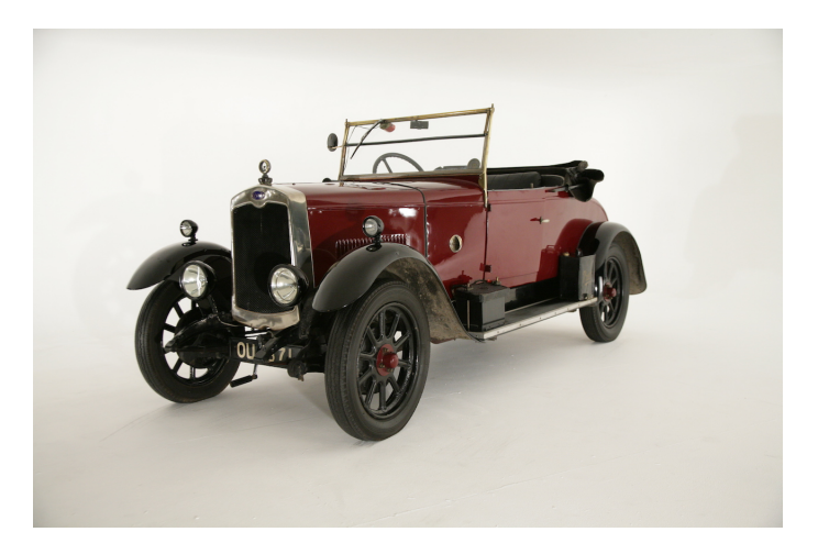
Rodger Dudding's 1929 Clyno 'Estate', produced in the last year of the company's existence.

The firm started producing cars in 1922 (the 1368cc four cylinder 10.8hp model, with a Coventry Climax engine, was launched at the Olympia Motor Show that year; approximately 35,000 were built during a six year production run), and Studio434 has a 1924 11hp Coupé, a very rare 1926 10.8hp van, a 1927 10.8hp convertible, a 1927 two seater Tourer and a 1929 estate.