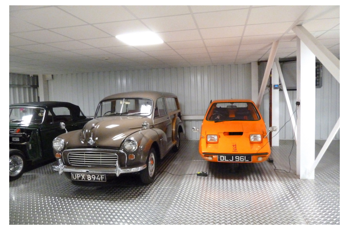
Bold Bond Bug, next to a Morris Minor 1000 Traveller.