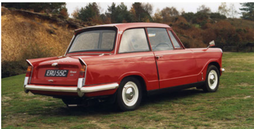
Pointed rear fins and minor bump resisting 'wrap-around' rubber bumpers came as standard.

Rare today are the Coupé and Courier van versions. The Herald convertibles have always been appreciated for their affordable blend of four seater practicality and open top motoring.