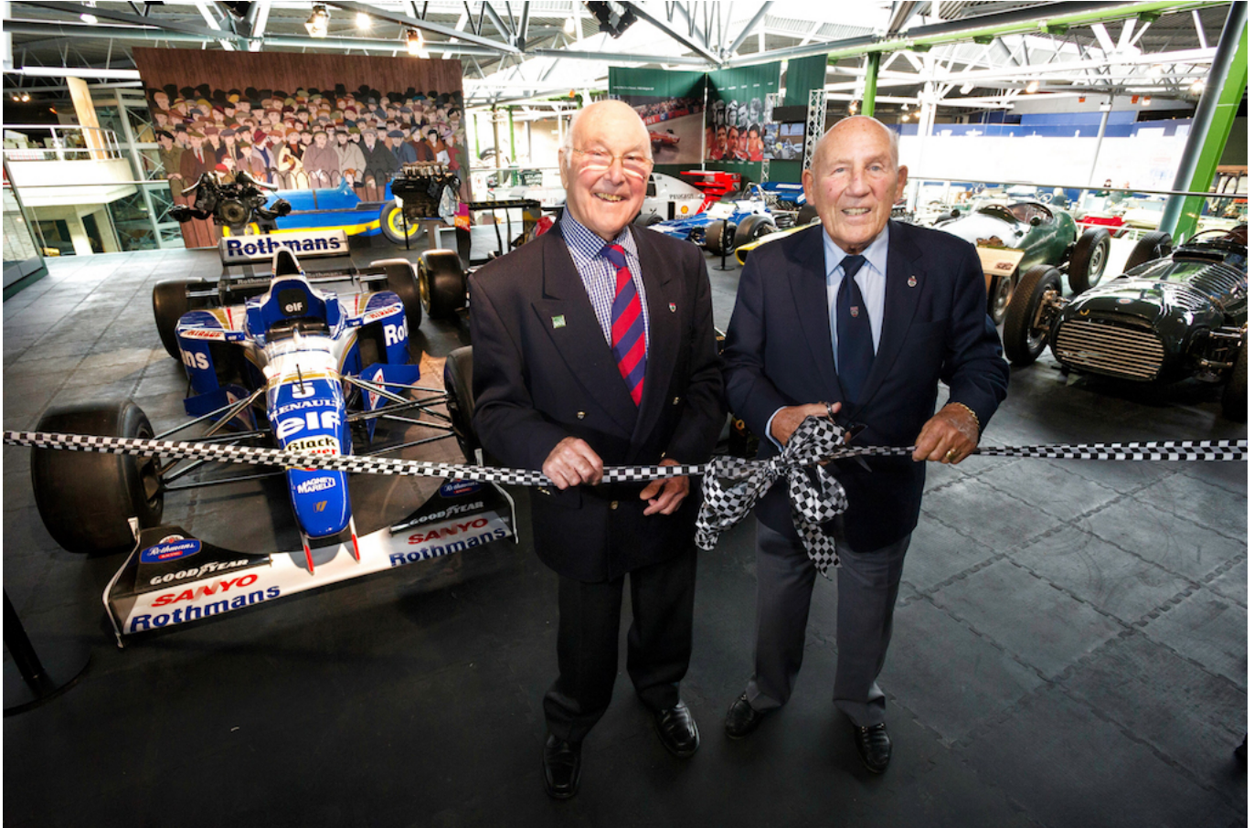
05 March 2015. Opening of two motor sport displays; Grand Prix Greats and Road, Race and Rally, collectively known as A Chequered History. VIP guests Murray Walker and Sir Stirling Moss officially open the new exhibitions.

Sir Stirling Moss, OBE, had a long connection with the National Motor Museum. He came to Beaulieu on April 5 th , 1959 for the opening ceremony of the new Montagu Motor Museum buildings, which were officially opened by Lord Brabazon of Tara. Other motoring personalities there included Raymond Mays, Tony Brooks, the Marquess of Camden and George Eyston.