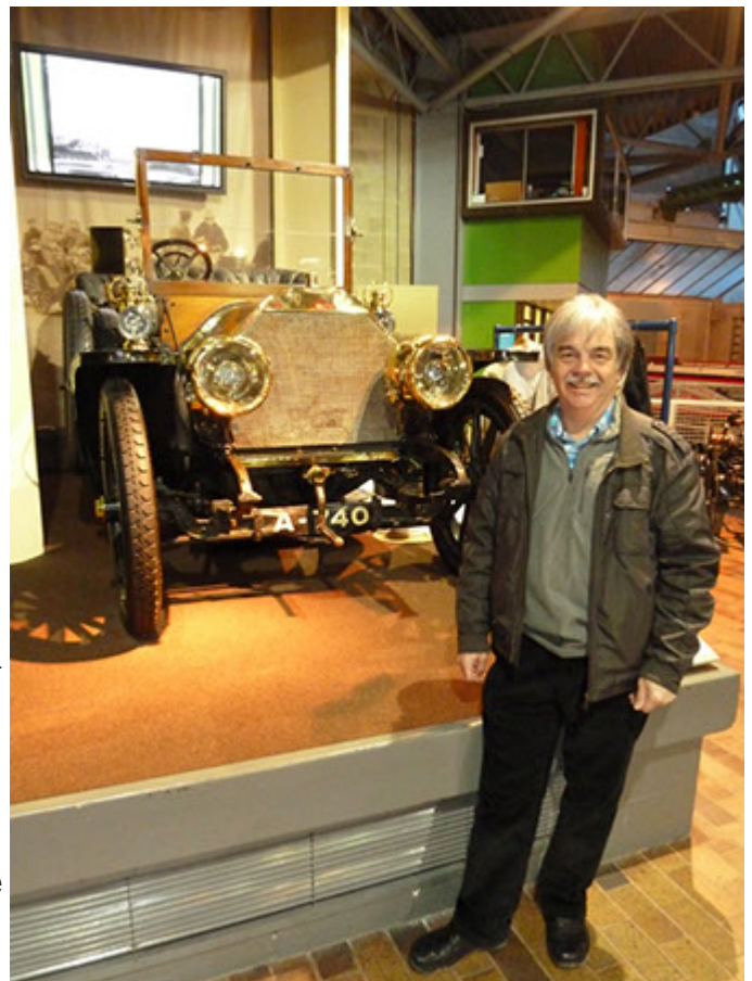
Yours truly in front of one of my favourite exhibits in the National Motor Museum, the 1903 shaft-driven 60HP 9.2 litre Mercedes.

The cars in the main part of the museum tell