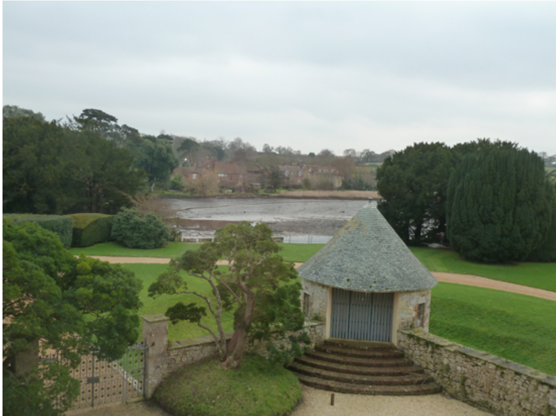
A view across the Beaulieu River, from an upstairs window in Palace House.