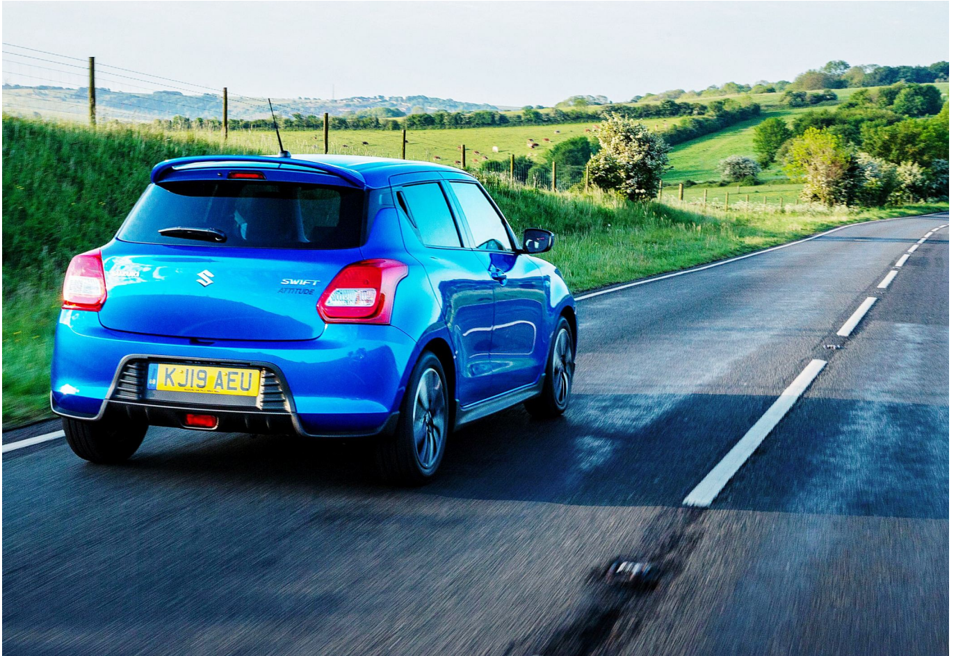
Swift SZ5 Hybrid Allgrip 4x4