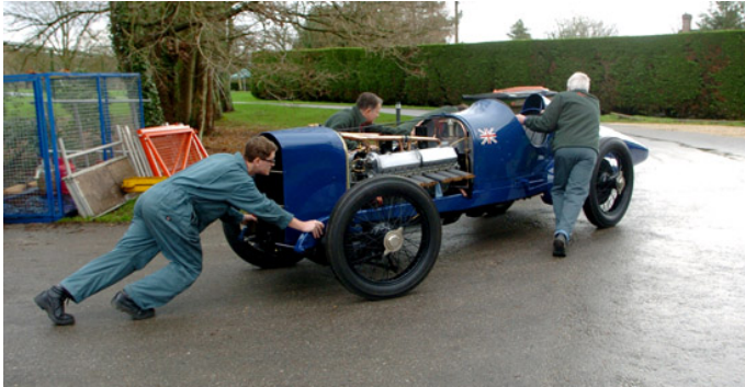
Preparing the Sunbeam to run again