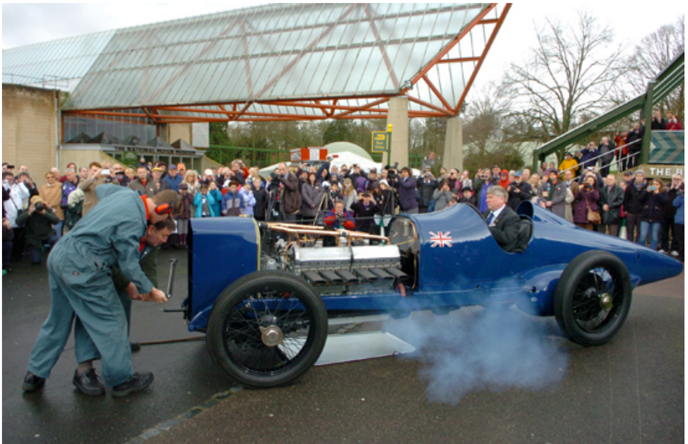
350bhp Sunbeam being fired-up again

Online version: https://www.wheels-alive.co.uk/sunbeam-start-up-national-motor-museum-beaulieu/