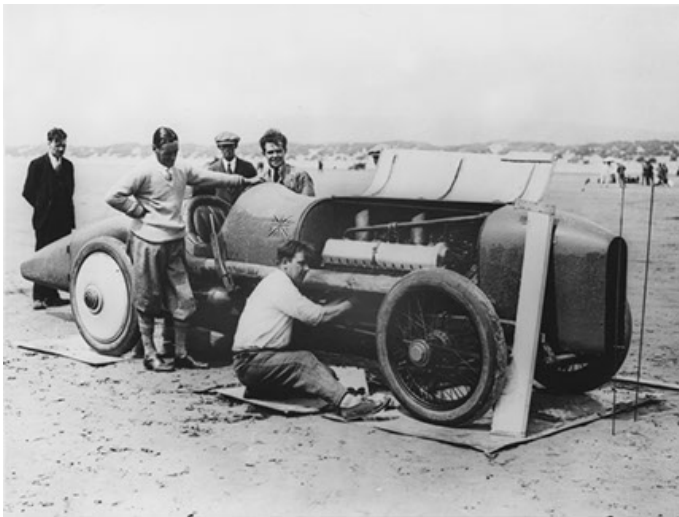
Preparing the Sunbeam for its record run at Pendine in 1925

Malcolm Campbell purchased the car in 1924 and re-painted it in his distinctive blue colour scheme and in September that year achieved a new record speed of 146.16mph at Pendine Sands in South Wales, raising it the following year to 150.76mph.