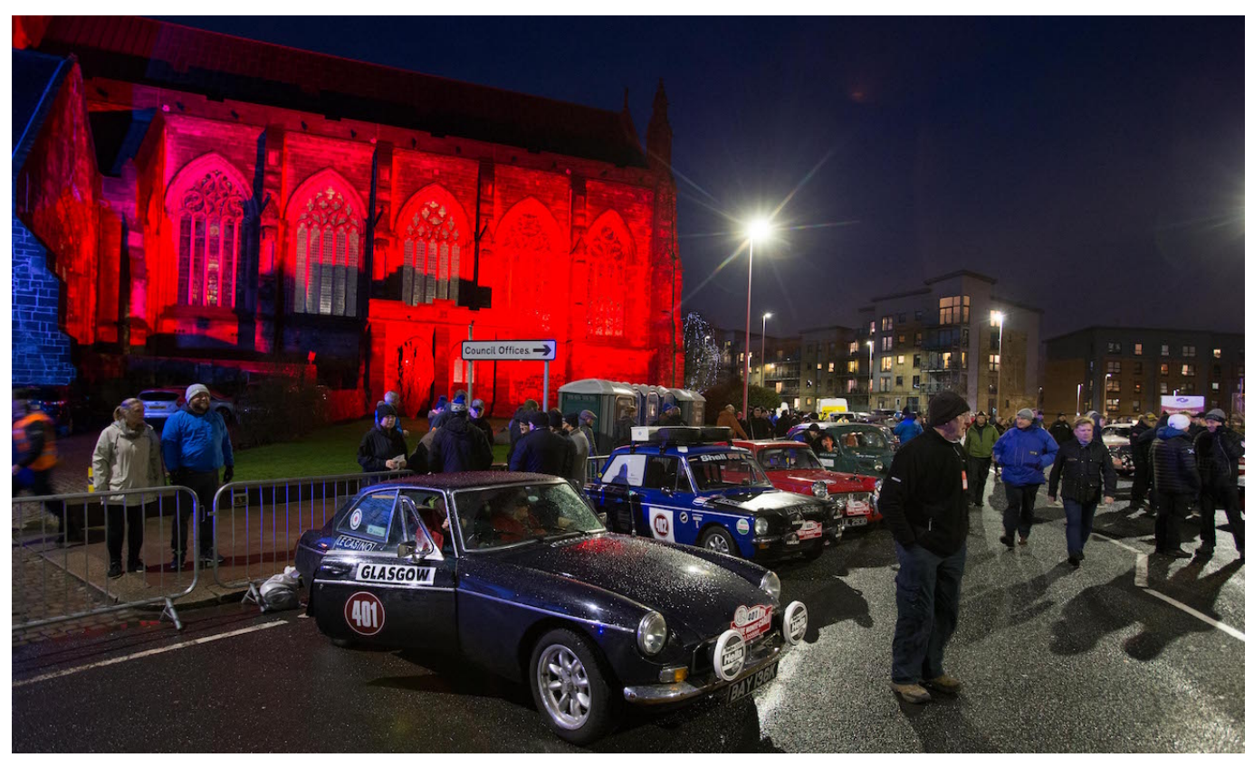
Some of the line-up of entrants line up in front of Paisley Abbey.

A party atmosphere in the centre of Paisley last night (31st January) gave a big send-off to the cars and crews in this year's start of the 2018 historic rally run to Monte Carlo.