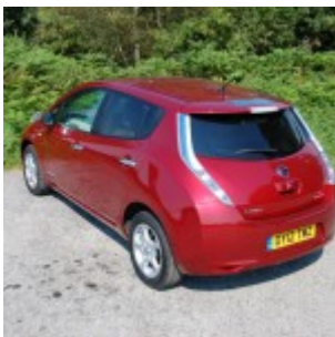
From the rear, the LEAF displays a futuristic appearance.

Further new innovative technologies are being developed by other manufacturers too.