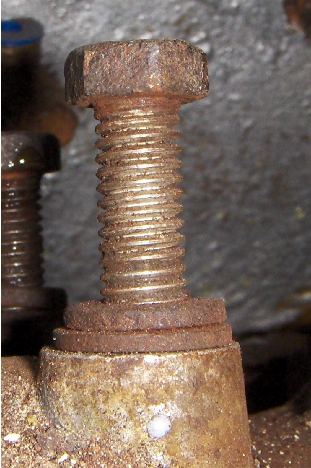
Above: UNC bolt in