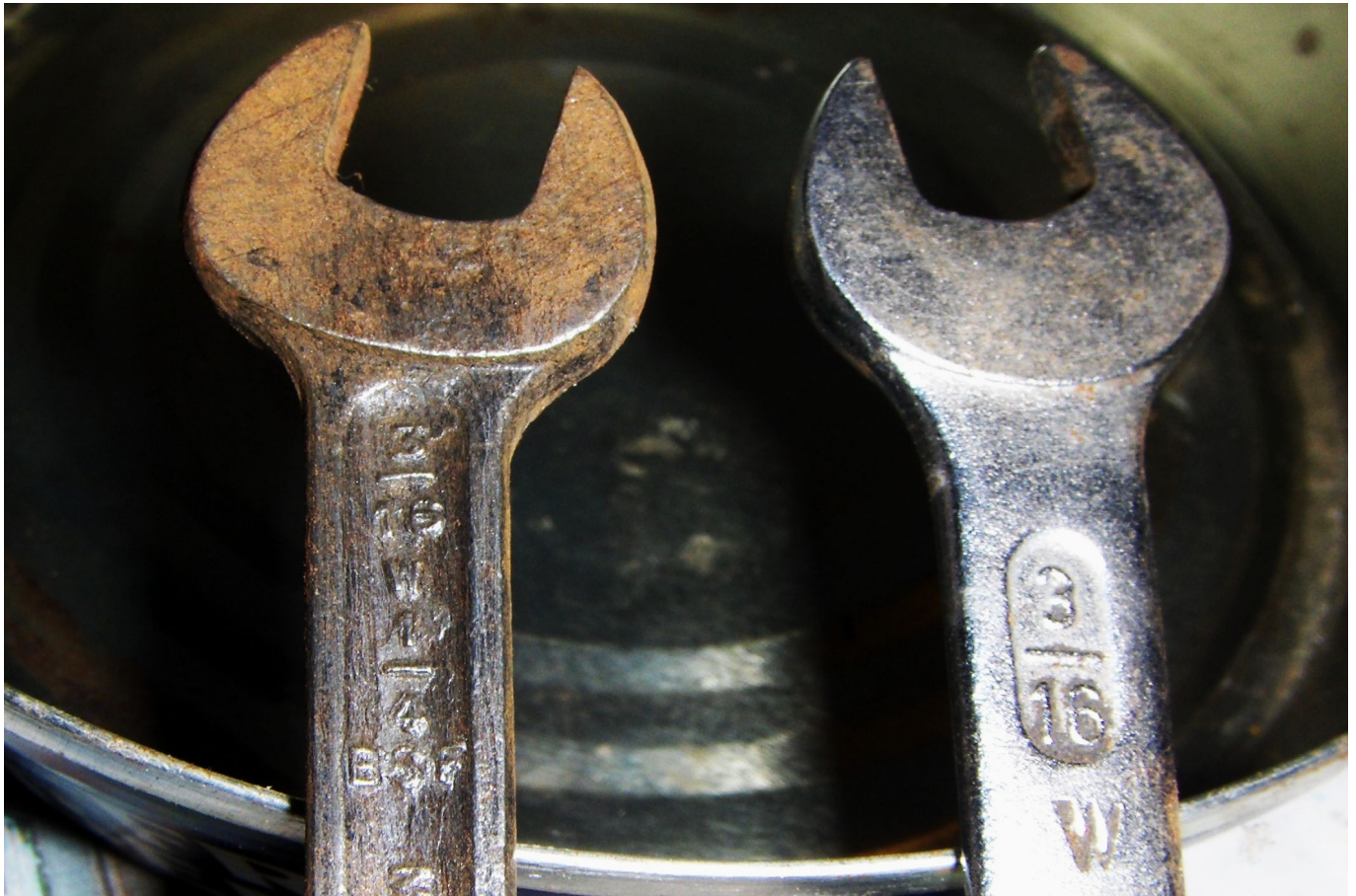
Above: Two spanners - WW and BSF dual and single