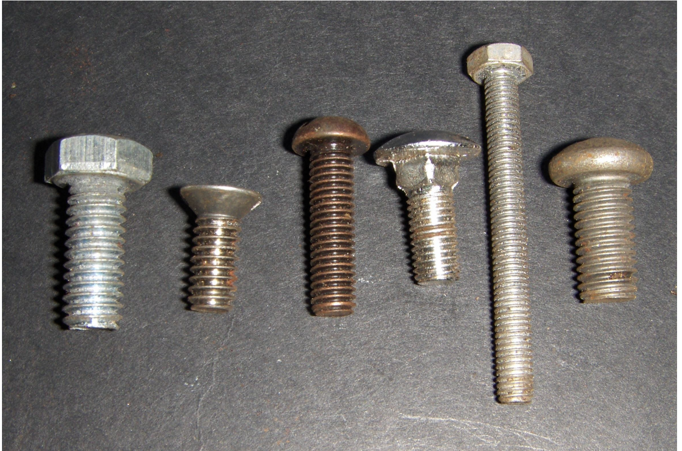
Above: Threads and heads all different

In Britain after the war, smaller threads were mostly in BA sizes, though occasionally, depending on where a car was built, small US unified and Metric sizes were also found. The picture shows some of the alternative small diameter threads still found in specialist applications.