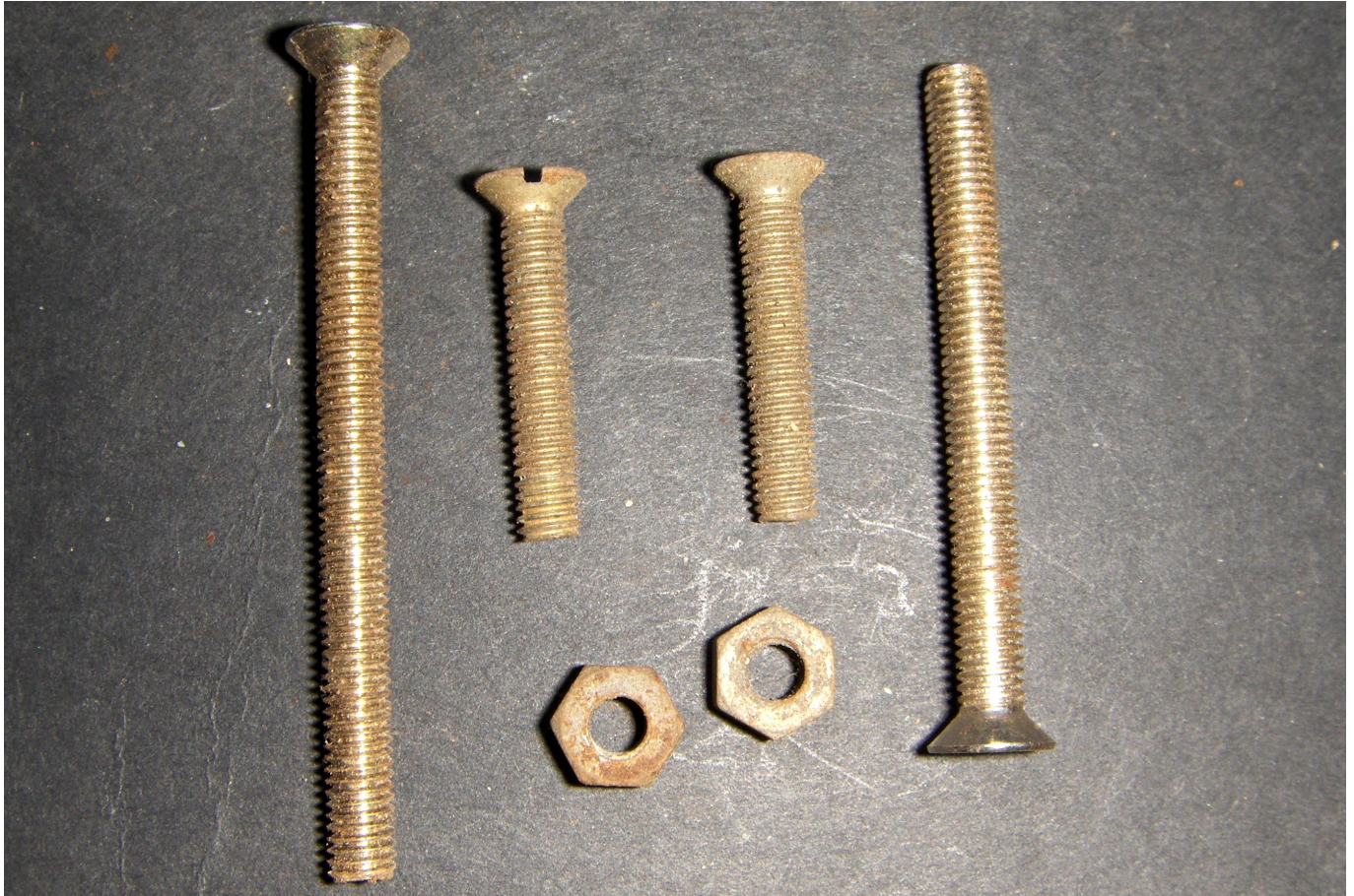
Above: Two x 2BA and nuts centre; two x 4 mm metric outer

The mainstay small fastener range on British cars built until the 1980s was the ubiquitous BA series. The two centre bolts and nuts here have 2BA threads, the two longer, outer bolts are 4 mm. While not looking dissimilar, and despite metric origins, BA nuts of similar sizes hardly turn on metric threads... Fortunately, the most common even-numbered BA fasteners from 0BA to 6BA remain available for replacement purposes.