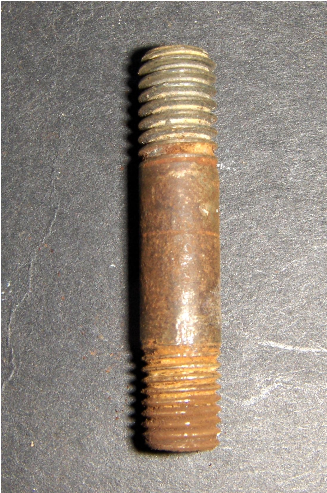
Above: Stud UNF