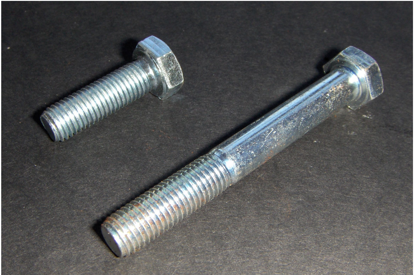
Above: UNF bolt and set screws

All the familiar common thread types remain readily available for automotive applications. Set screws are rarer in lengths beyond 3 inches/75 mm, though bolt sizes up to 4 inches/100 mm are common in light vehicles. Much longer bolts are found in larger applications, and threaded rod or “studding” is also seen in specialist or extreme situations.