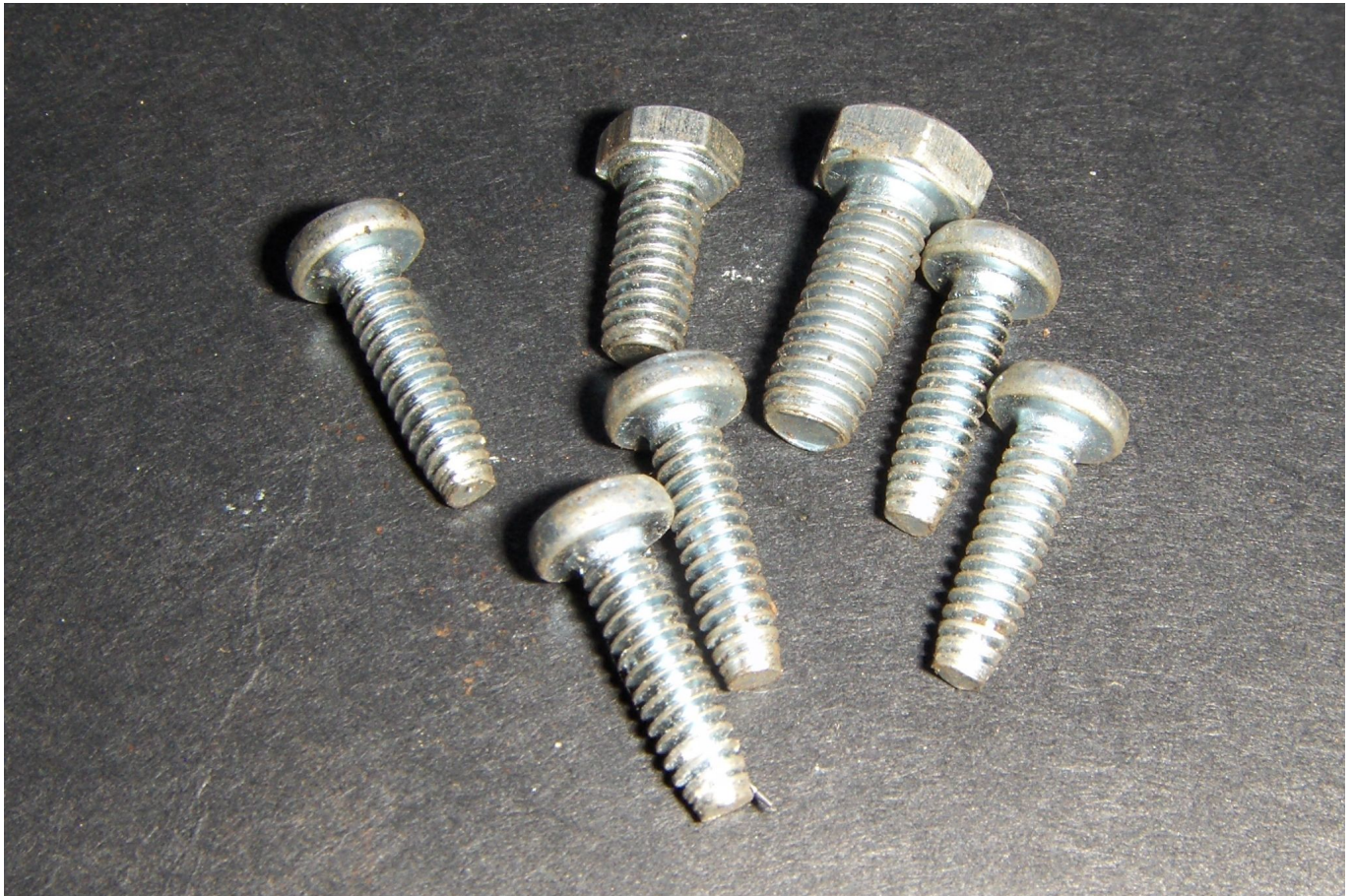
Above: Metric group small pan and hex

Smaller diameter fasteners on post war British vehicles were mostly in 0BA ( \frac{1}{4} " 2BA, 4BA and 6BA sizes, especially in instrumentation, electrical, and smaller mechanical items. These however are small Metric fasteners, offered in rationalised millimetre sizes down to smaller than 6BA, and long found on vehicles assembled in Europe and elsewhere. Note that, like UNF and UNC, Metric fasteners are available with fine and coarse threads.