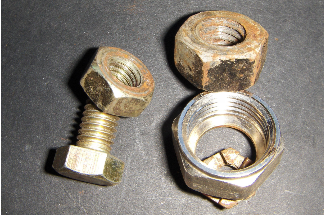
Above: Three nuts, one set screw

The two nuts at top left and right are Whitworth threads... The set screw on the left appears to tighten on the Whitworth nut (note the damaged thread) above it - but is UNC threaded. On older vehicles, always look out for - and replace - mismatched nuts and bolts: they can be dangerous, especially in engine and suspension applications. The nut at bottom right is old enough and big enough to be Whitworth threaded - but its actually a British Standard Pipe (BSP) thread, fitting a high pressure gas regulator.