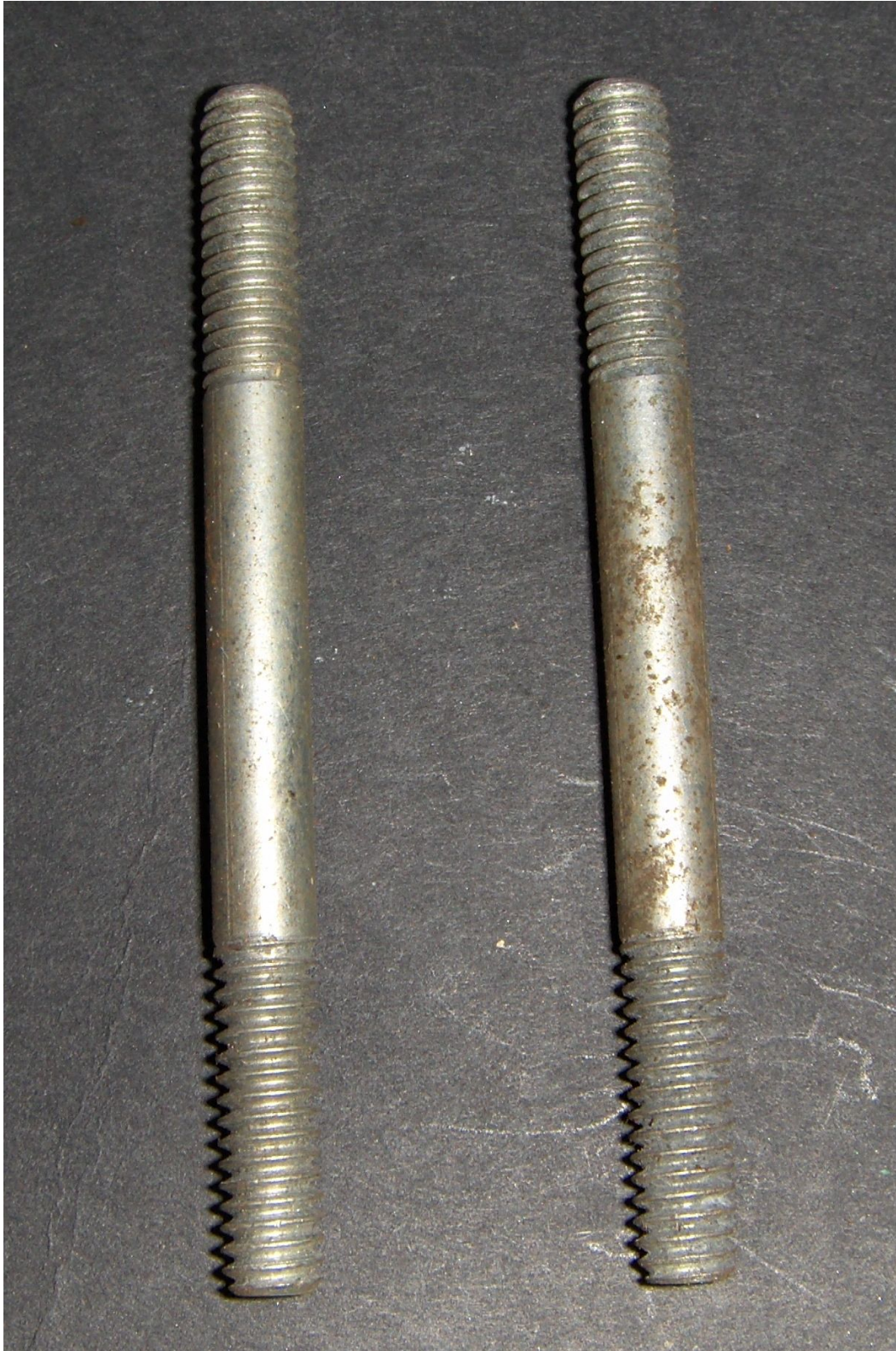
Above: Pair of studs,