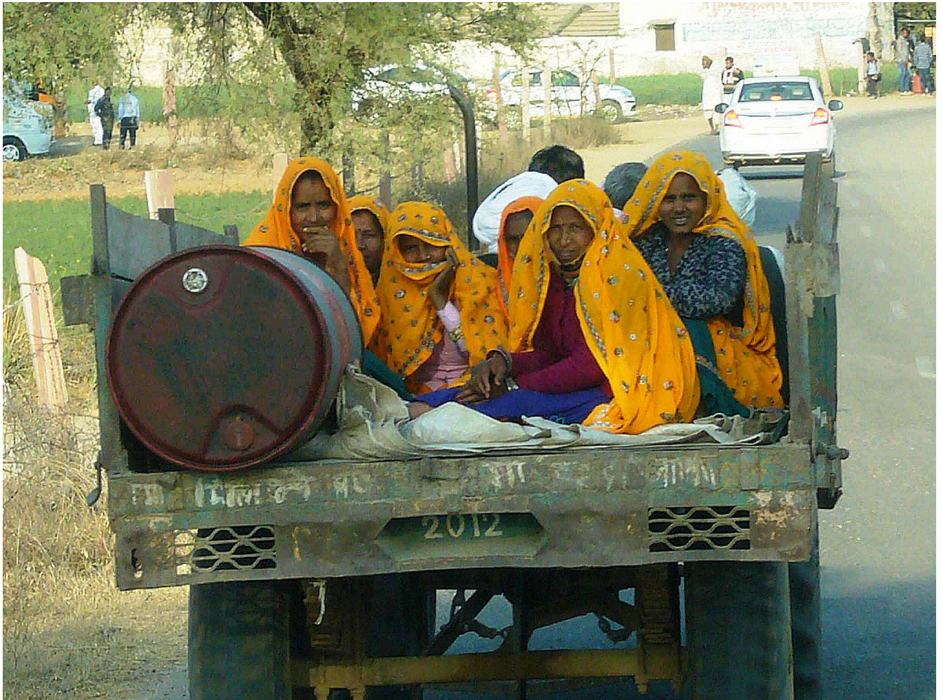
Above: A Rajasthan family making their way back to their Thar Desert home complete with a barrel of fuel.