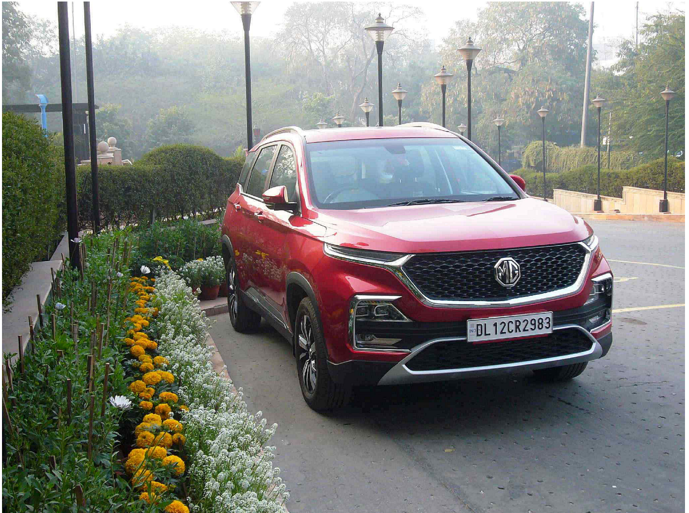
Above: The latest MG Hector large SUV waiting to transport company executives to the Indian Motor Show in Delhi.

This latest visit to India was our fifth in just over a decade so we have seen most of the main areas of the country but each time we go we see changes have taken place, mostly for the better as far as the quality of life for the majority of the population – but not for all. There has been huge investment in the country's infrastructure with new high tech businesses, new roads, new houses, improved schooling and health facilities and a fast growth in tourism. The country has, in normal times, over 10.5 million visitors annually, many Brits, Australians and this time we saw more Americans and Germans than on previous visits. There also seemed to be many more domestic Indians visiting more of the traditional tourist