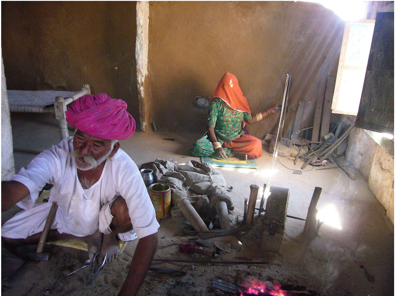
Above: A Rajasthan blacksmith and his wife, with the traditional veil covering her face. She operates the homemade bellows to power the forge where her husband makes trinkets to provide income from tourists to the Thar Desert.