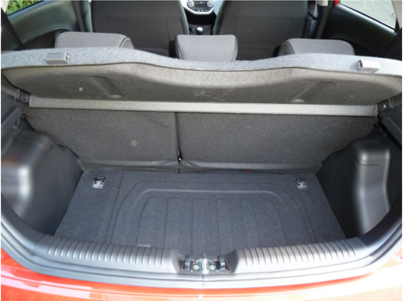
The Picanto's boot is quite spacious, and the folding rear seat divides on a one third/two thirds basis.