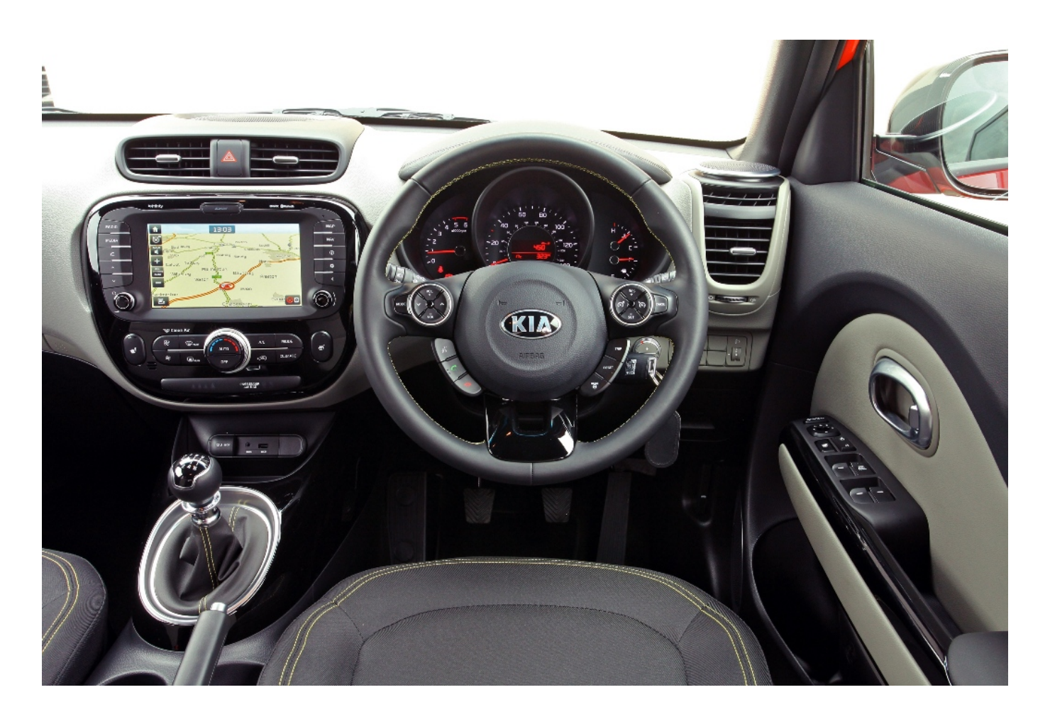
The 1.6 litre petrol engine gives reasonable power to move four people and it pulls steadily but you know it's working hard by the engine note when it's trying in the intermediate gears. The emissions are on the wrong side of the new BIK limits however, and you pay a lot in road and other taxes as a result when compared with cleaner engines.

The gearchange is good, a light clutch and direct selection mean it's no hardship in town while the steering needs no effort to park and the brakes are good at hauling down speed or holding on a steep hill.