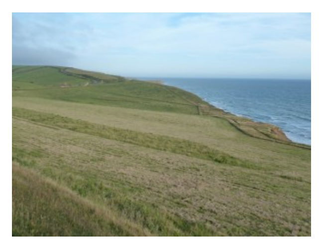
We stayed at Shanklin but couldn't resist a run in the evening sunshine along the old military road running along the Island's south coast. This provides unspoilt sea views to the south and west (and the mainland coast of Dorset).