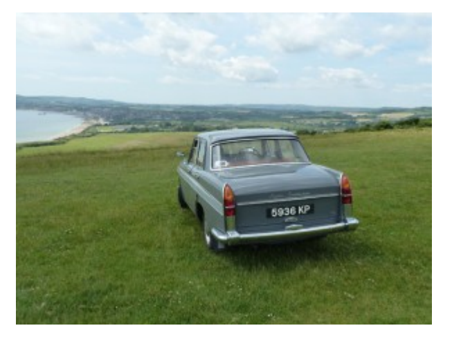
Even on a summer Sunday, there's usually plenty of room on the grass-covered, free-ofcharge car parks on the west side of Culver Down. This is a great place for breathing fresh air, picnicking, going for long walks with sea views...