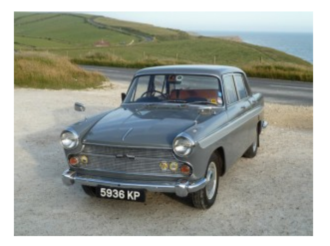
Relatively quiet roads, wonderful countryside and coastlines, and no necessity to be in a hurry make touring on the Isle of Wight especially happy in a classic car like our Austin A60 Cambridge, seen here on the Island's south coast.