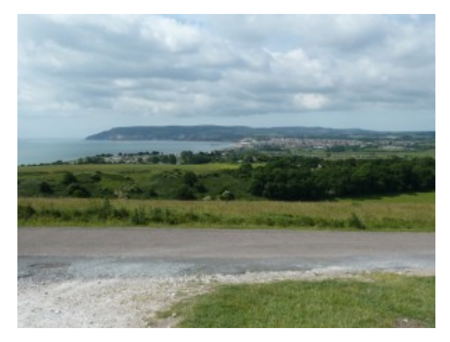
On a sun-bathed hot summer afternoon, the views looking westwards from Culver Down are especially lovely. In this shot the seaside resorts of Sandown and Shanklin can be seen, with the rolling hills beyond.