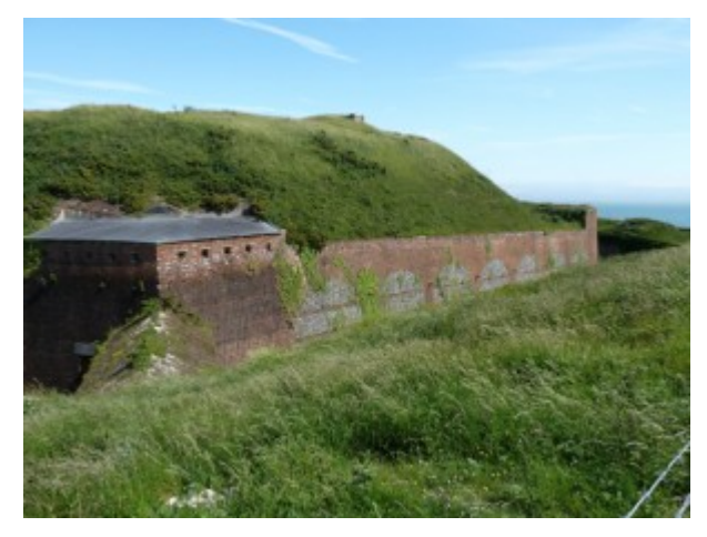
Even today the Bembridge Fort is impressive, incorporating massive brick walls and a deep moat. Its position, high up on the Culver Down headland, was strategically important, with excellent sea views to the south.

A National Trust information sign also provides information about the huge Bembridge (Culver Down) Fort, built between 1862 and 1867 as a defence against possible invasion by France's Napoleon III.