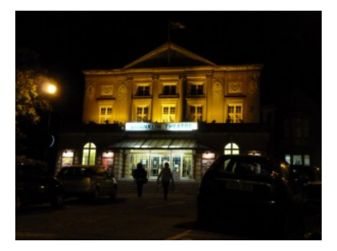
The Shanklin Theatre – attractive inside and out – plays host to big names, as well as performances by amateur dramatic associations (such as the excellent Newchurch Drama Group – while in town we watched them perform).