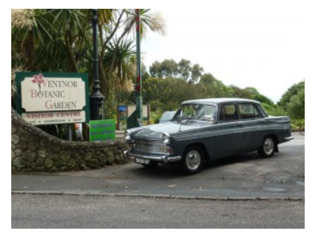
After reaching the old military road, high up on the south coast, we headed east, enjoying sea views as we travelled, then stopping en route at the picturesque Ventnor Botanic Garden – this requires plenty of time to fully appreciate.

After we crossed the sunlit Solent to Yarmouth (about 40 minutes), we enjoyed the short drive westwards to Freshwater, then inland towards the Island's south coast. We stopped for a tasty lunch at the fascinating Chessell Pottery Barns.