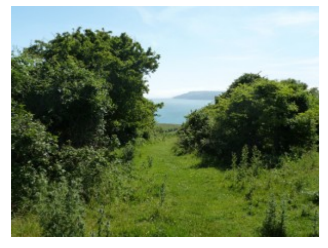
Unexpected views around every corner... We found this one just a few yards from the main car park on the Culver Down headland. The nearby cliffs have their dangers of course, but there is plenty of safe walking on the main paths.