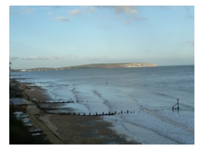
This shot was taken one evening from the zigzag walk at Rylstone, looking towards Red Cliff and Culver Down. (On days when there's a beautiful sunset, the cliffs at Red Cliff eventually turn red – hence the name).