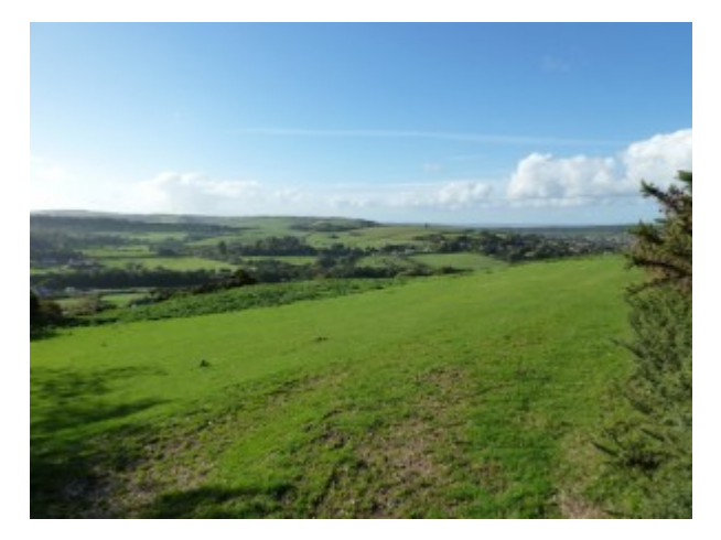
From the hills inland, towards the centre of the island, there are views in all directions across rolling countryside to the sea. This shot was taken looking westwards, from near Newport Golf Course.