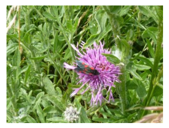
Culver Down has plant, bird and insect wildlife in abundance, and with plenty of springy turf topping the chalk base. Depending on your preference, walking can be easy (on the main paths), or more challenging...