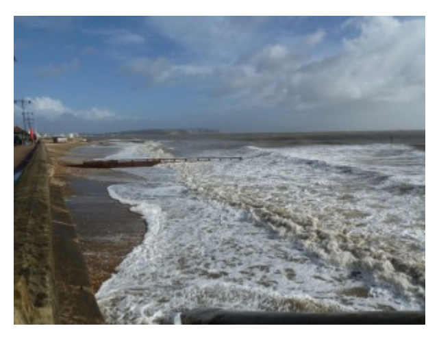
A bright morning at Shanklin... On the last day of our Island break, we ventured down to the sea to see the sun on the surf for the last time before departing for our mainland home. We shall hurry back again for sure though!