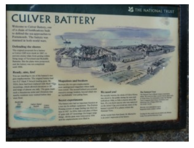
A National Trust signboard gives fascinating information about the origins of the Culver Battery, which was manned in both Word Wars in the last Century. The original proposals for a battery here had been made in 1887.