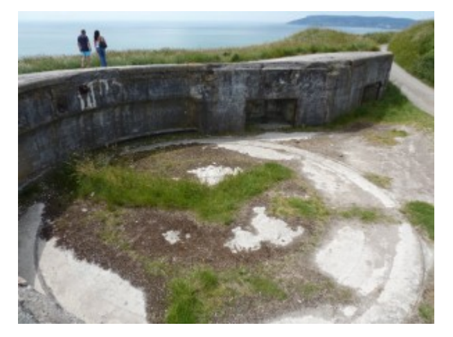
A reminder of less peaceful times... The Culver Battery gun emplacement provides stark contrast with the surrounding natural beauty of Culver Down. For many years (until 1966) this area was a 'no go' place for the public.