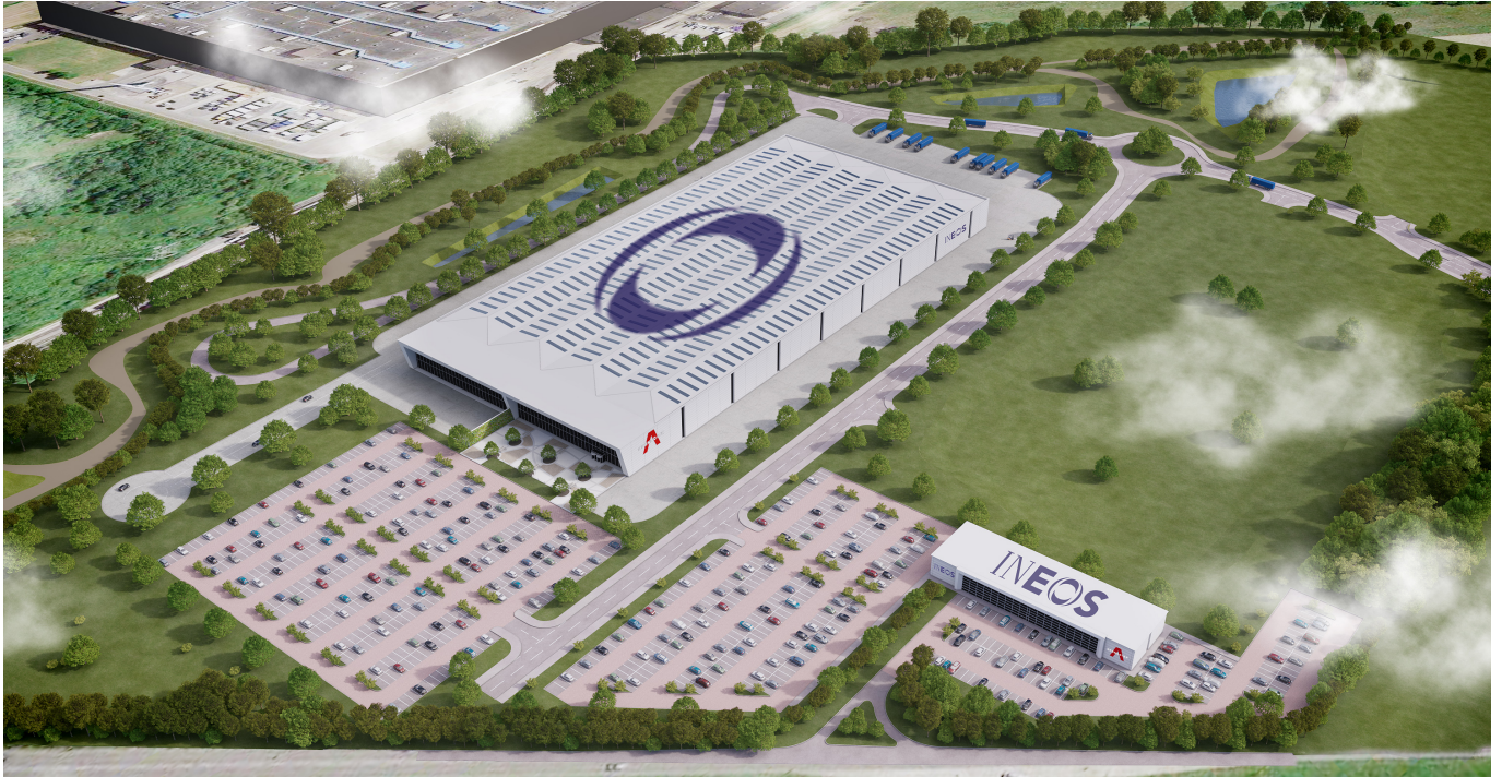
Ineos Bridgend factory; aerial view of proposed buildings and layout.