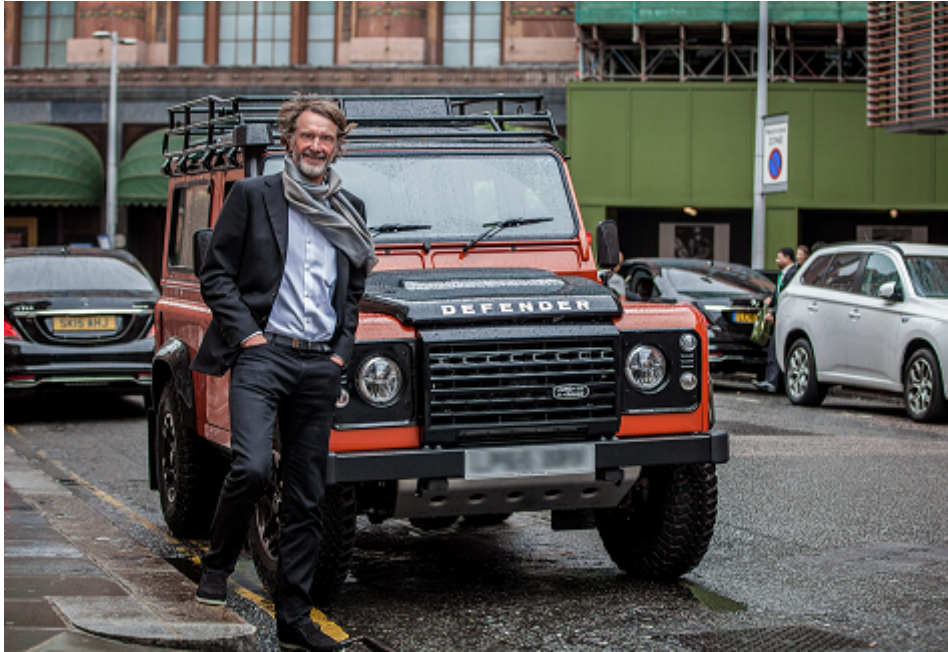
Sir Jim Radcliffe, founder of Ineos, with a Land Rover Defender which his Grenadier model will replace.

The go-ahead today follows months of speculation that the so-called Projekt Grenadier's backer and one of the UK's richest men, Sir Jim Radcliffe, wanted to build his serious 4x4 model in Britain under his Ineos Automotive brand.