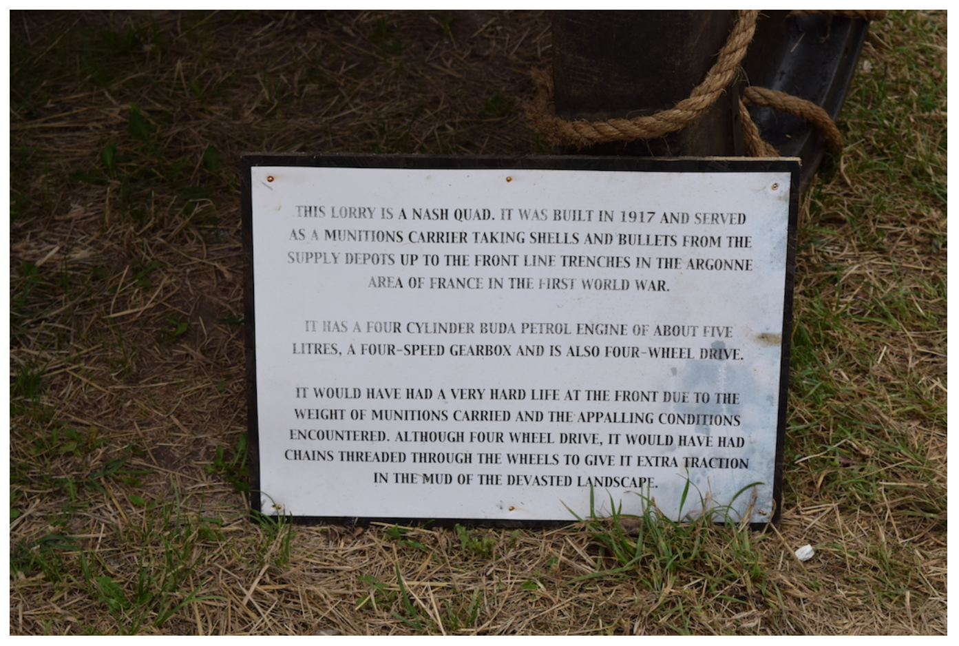
Information on the Nash Quad shown in the previous photograph.

By contrast with the happy noise around the rest of the Show, this World War I Commemoration area was hushed as visitors reflected, with respect, on the global events of 100 years ago.