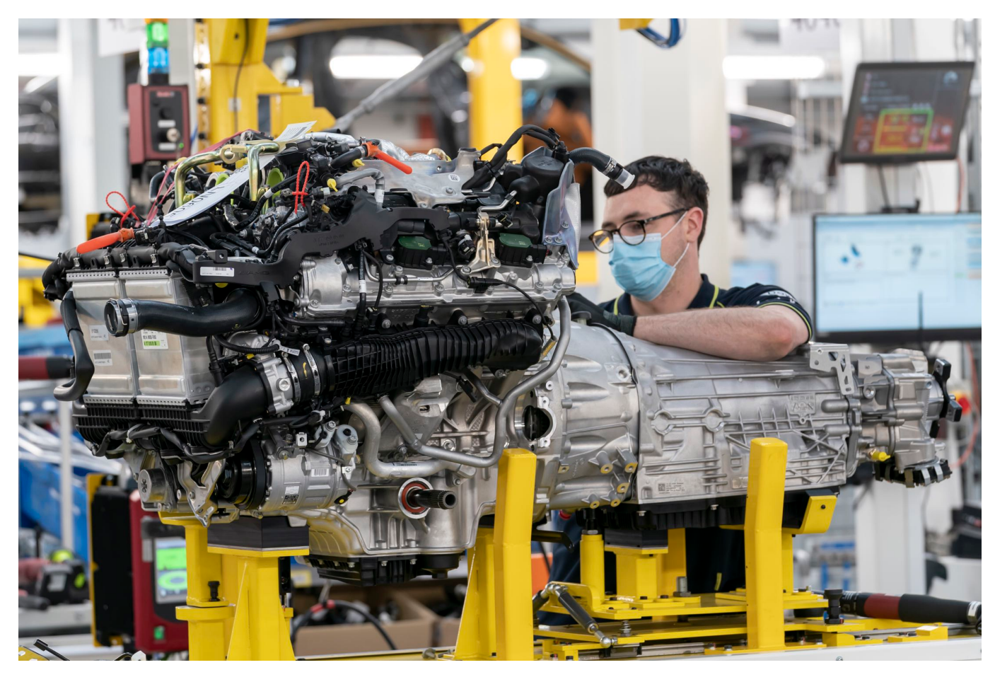
DBX engine build.

There is now a 2,000 name waiting list and that's eating up production to next spring with 80% of cars going abroad, mostly to America and China.